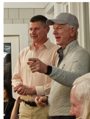
Senator Thomas Tuberville makes a surprise visit to the MOAA chapter meeting/dinner.