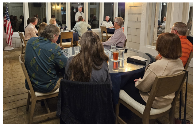
November chapter meeting listening to Senator Tuberville with updates in Washington D.C.