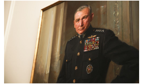
A portrait of Gen Paul X. Kelley, 28th Commandant of the Marine Corps, hangs at the Home of the Commandants at Marine Barracks Washington in 2014.

Kelley, a Life Member of MOAA, was truly a Marine's Marine. He commissioned into the Marine Corps in 1950 after graduating from Villanova University. He served 37 years in the Marine Corps, including assignments commanding reconnaissance Marines, serving as the exchange officer with the British Royal Marines, and working as the Combat Intelligence Officer for the 3rd Marine Amphibious Force during