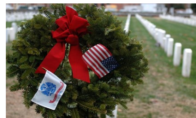
Wreaths Across America

If you or a friend would like to donate to Wreaths Across America, you can click on this website to go directly to the chapter's page for donations helping the Ft. Mitchell Cemetery receive wreaths. You can even donate (purchase wreaths) in memory of someone.