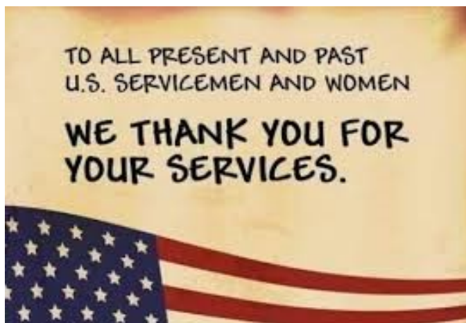
https://images.search.yahoo.com/yhs/search; ylt=AwrC3L5GBqtf F QALqIPxQt.; ylu=Y29sbwNiZjEEcG9zAzEEdnRpZAMEc2VjA3BpdnM-?p=veterans+day+2020&type=cr hp_sep20_wk43_2020&param1=f1