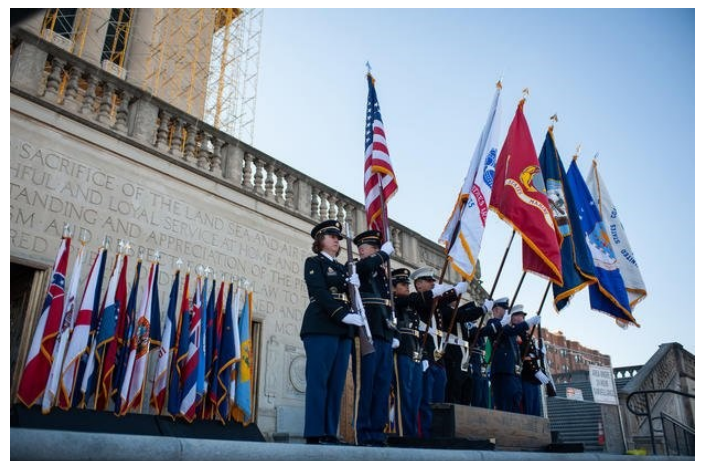
A joint service color guard presents the colors during a Veterans Day ceremony at the Indiana War Memorial in Indianapolis, Nov. 10, 2018.