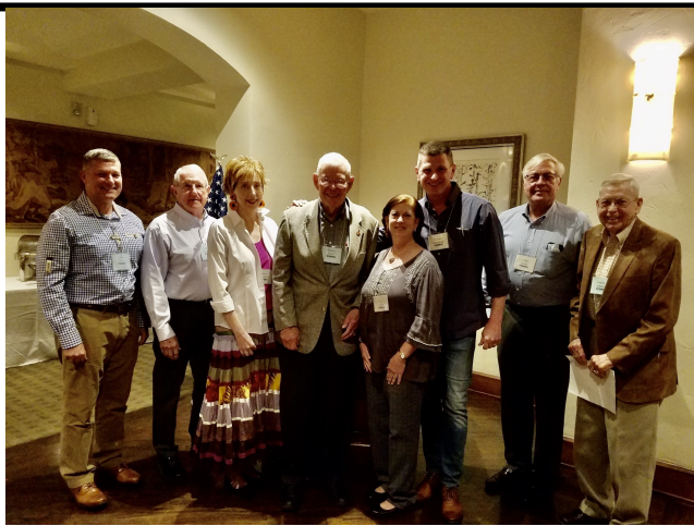
Left Photo: R to L

Join ECAC Online! https://ecacmoaa.com/join-ecac