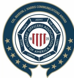
Harris Award 2018