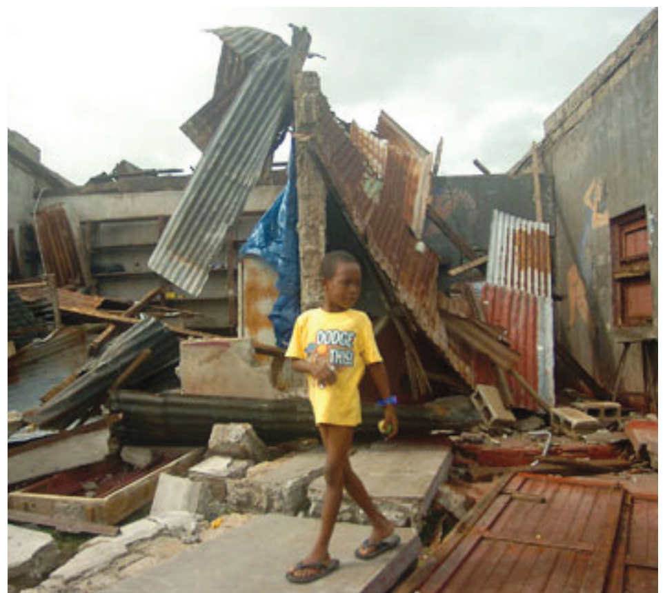
A Fijian child walks past damage caused by Cyclone Tomas

Reports also say guests in holiday in resorts in the northeastern region escaped the main force of Hurricane