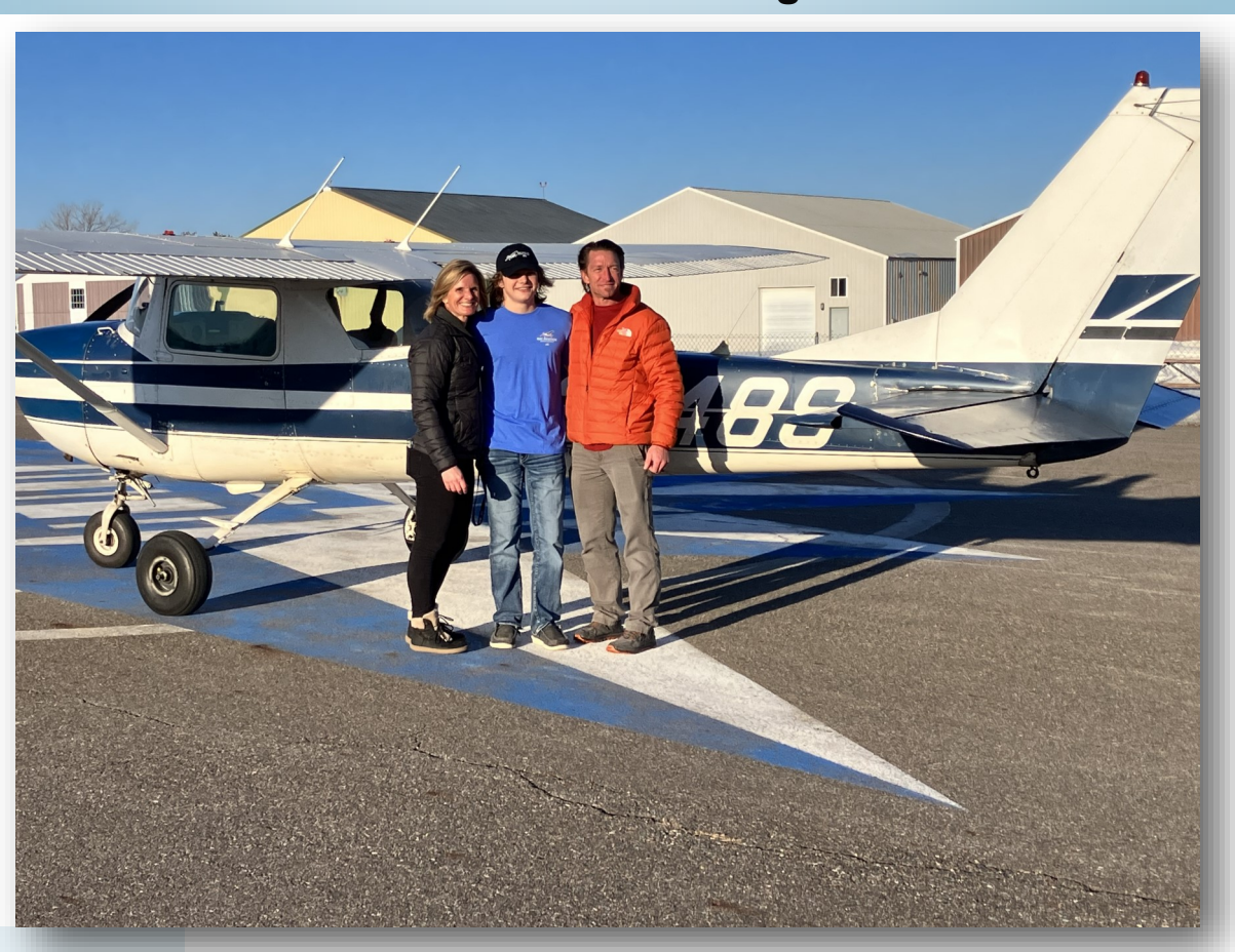
Flying Club and Build A Plane Student Takes First Solo Flight