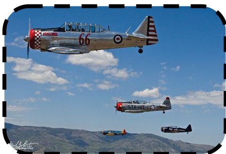
Pictures from the National Air Racing T-6 Class Photo Gallery airrace.org