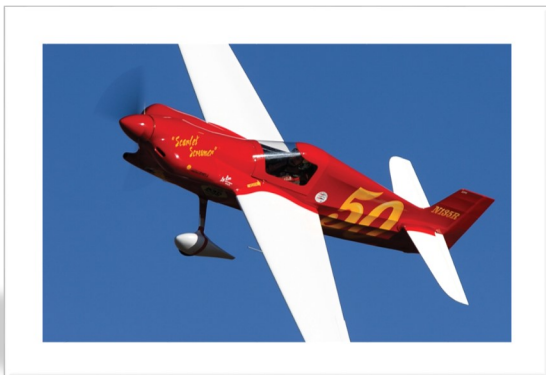
Pictures from National Air Racing Formula One Class Photo Gallery airrace.org