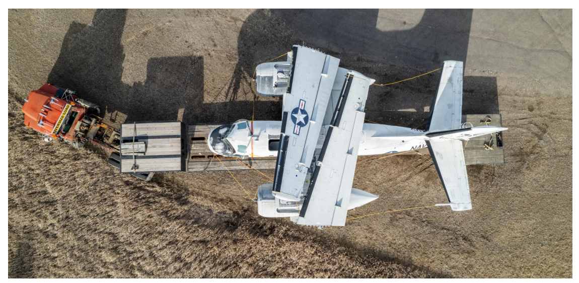
The STOOF in Princeton.

After so many February's having the state of MN snow bound, we were all concerned that we would be moving this aircraft in a snow storm. God and Mother Nature shined on us this year. Temperatures in the 50's during the day and low 30's at night. Thank you to all of you that were praying and helping financially to move this historical artifact from the Cold War Era.