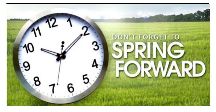
Daylight Saving Time begins Sunday, March 9, don't forget to set your clock ahead one hour.