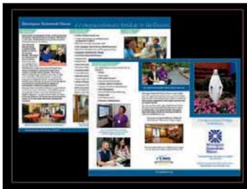
Monsignor Bojnowski Manor