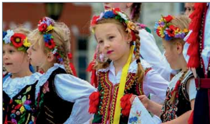
New Britain Polish Festival