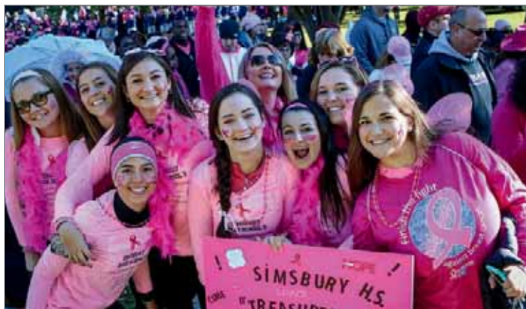
Walk for a Cure