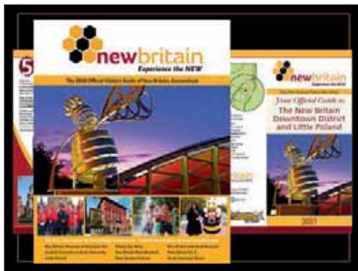
City of New Britain Visitors Guide