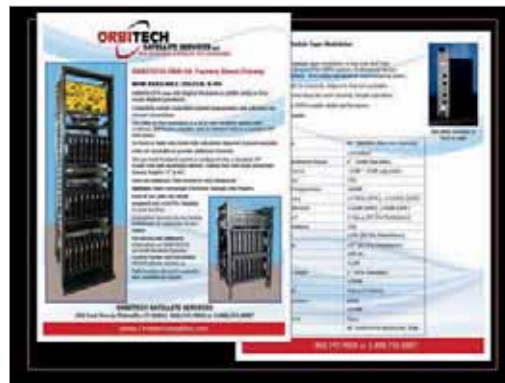
Orbitech Satellite Services, LLC