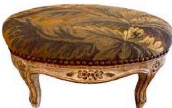
FURNISHING 19th Century French Petite Foot Stool with Aubusson $1,045