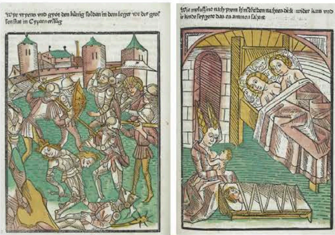
ART PIECES Prints of Woodblock Illustrations from Medieval Book, c. 1476 $16