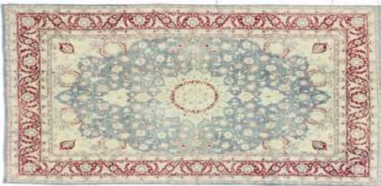
FLOORING MATERIAL Distressed Antique Persian Tabriz Rug with Modern Rustic English Style $8,999