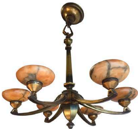
LIGHTING FIXTURE Rare Early 1900 Jugendstil Broze Pendant with Six Alabaster Shades $2,979.13