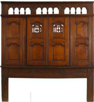
FURNISHING Italian Renaissance Walnut Queen Headboard $16,500