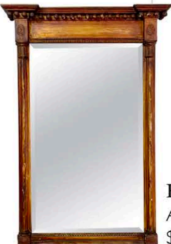
FURNISHING Antique Gilt Empire Trumeau Mirror, Foxed, c. 1820 $1,729.67