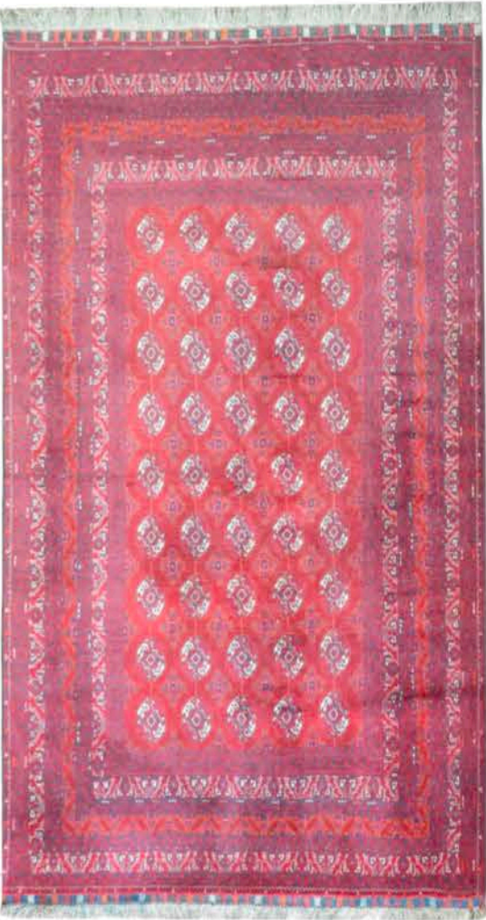
FLOORING MATERIAL Vintage Afghani Turkoman Rug with Floral Detailing $3,650