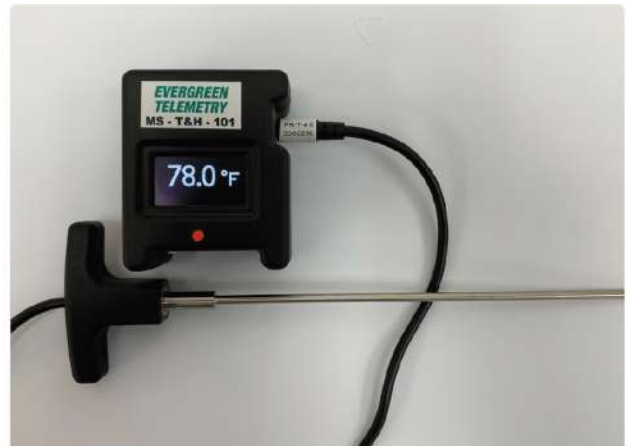
MS-TH-1 with PR-T-4 Immersion Probe