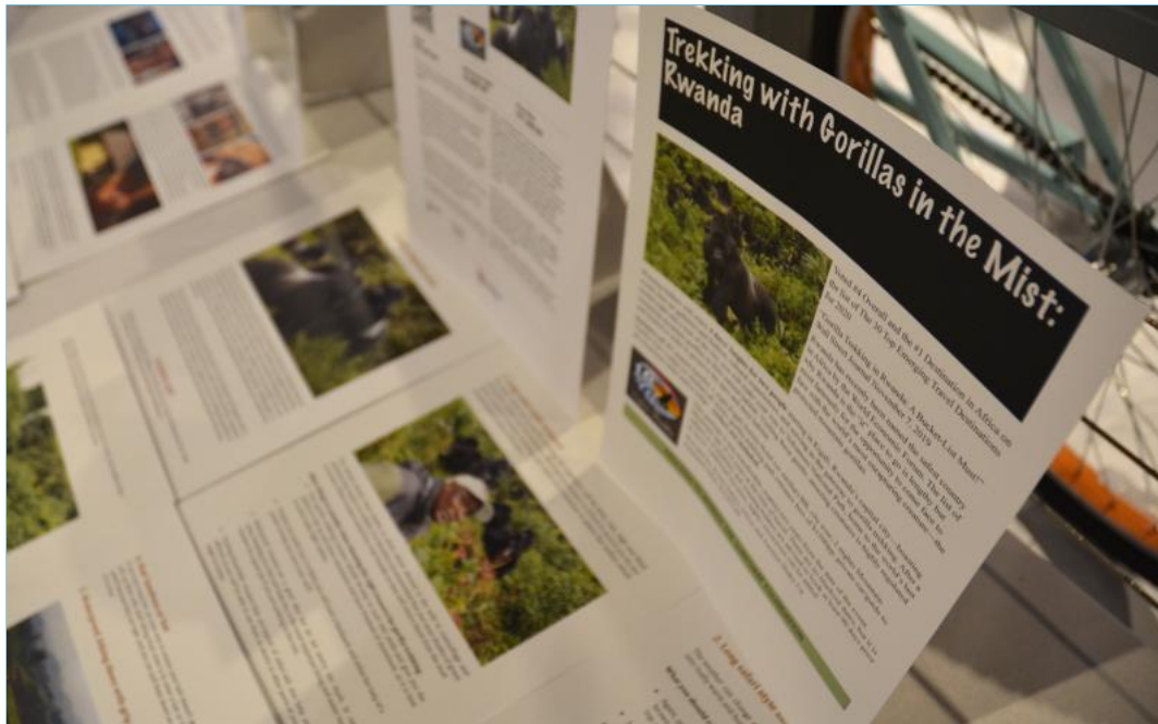
As usual, there were some big-ticket items up for auction, including this trip to Rwanda.