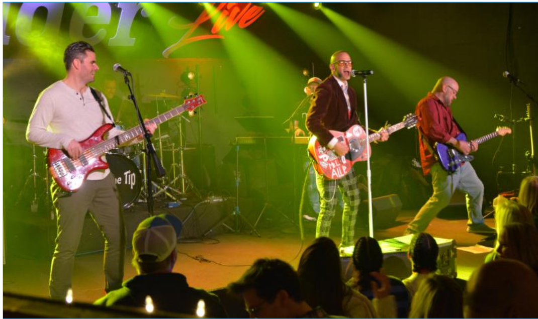
Just The Tip keeps attendees moving.