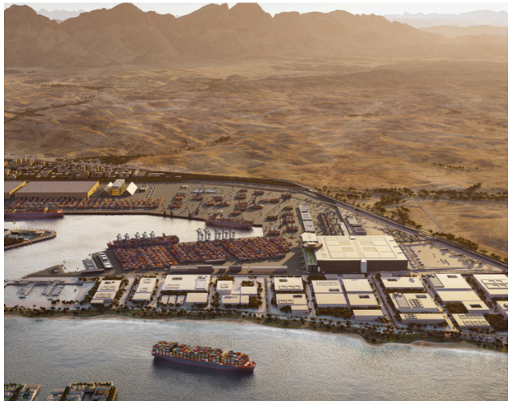
Development of Port of NEOM continues at pace ahead of 2026 launch of Terminal 1, which will enable the port to receive the world's largest container vessels