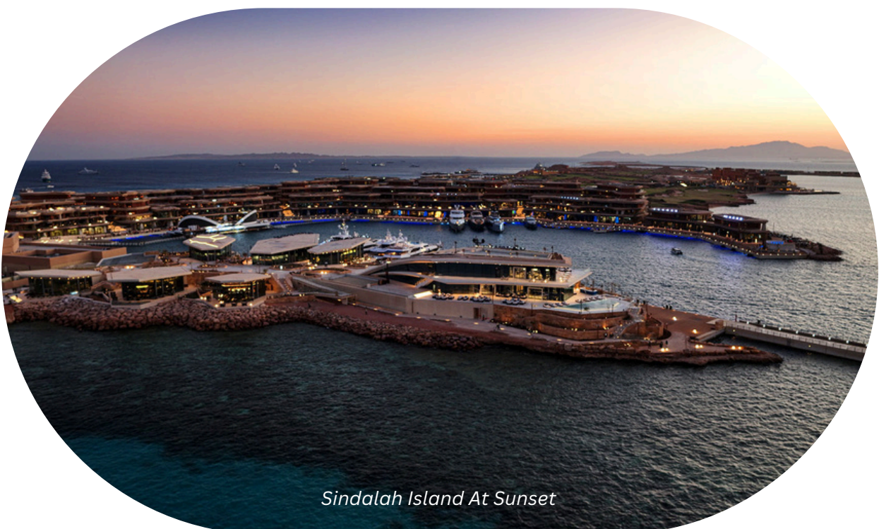
Sindalah Island At Sunset