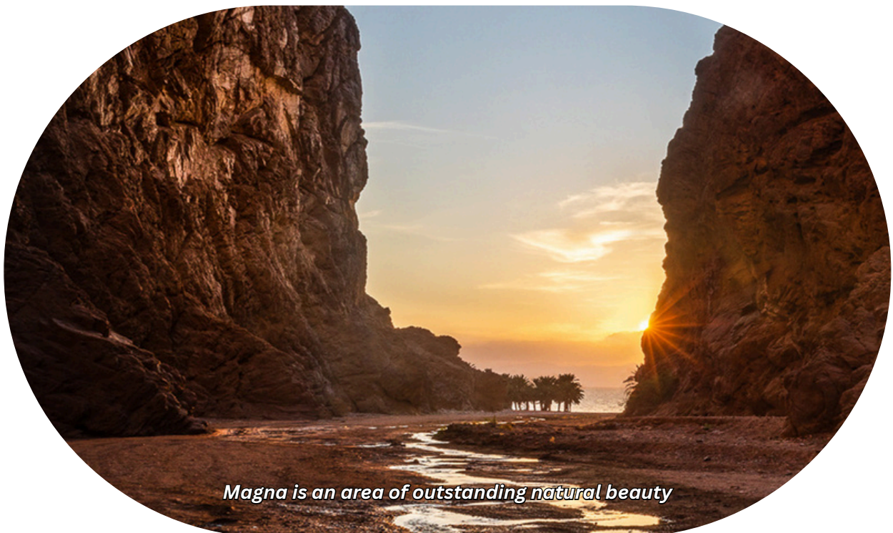
Magna is an area of outstanding natural beauty

The success of Magna will serve as a powerful catalyst for Saudi Arabia's tourism ambitions, showcasing the Kingdom's commitment to innovation, sustainability, and excellence in hospitality. As the first guests arrive at these revolutionary properties, Magna will undoubtedly establish itself as a premier destination for discerning travelers seeking the perfect synthesis of luxury, nature, and cutting-edge design.