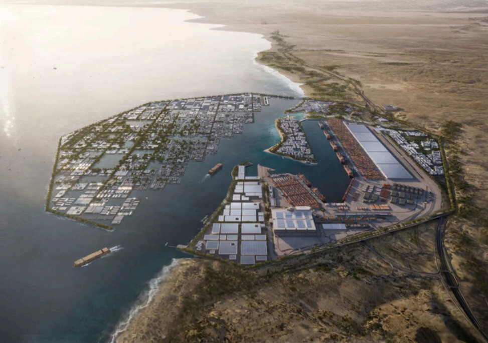
Port of NEOM welcomes first automated remote-controlled cranes in Saudi Arabia, advancing automation and boosting trade links on the Red Sea