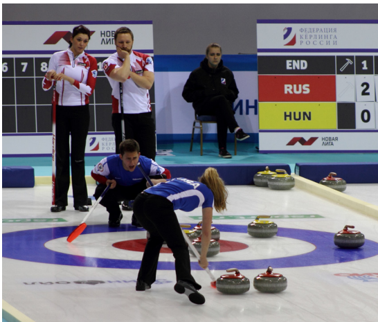
Figure No. 1 - Centre Guard