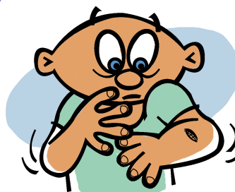
SLOW HEALING WOUNDS

HIGH BLOOD GLUCOSE MAY LEAD TO A MEDICAL EMERGENCY IF NOT TREATED.