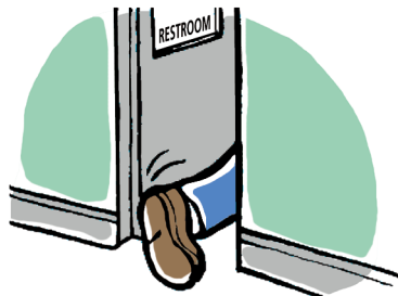
NEED TO URINATE OFTEN