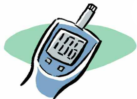
CHECK BLOOD GLUCOSE

If your blood glucose levels are higher than your goal for three days and you don't know why,