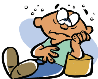
WEAKNESS OR FATIGUE