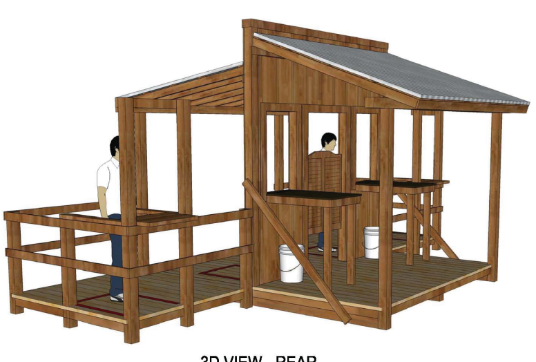
3D VIEW - REAR