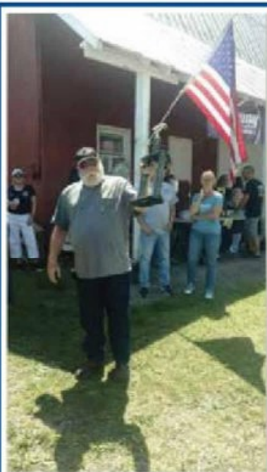
Congratulations Modified Muscle Car WINNER

Now gossip has it that we don't know who did this... but see the yard below!! Everywhere you see a circle is a flamingo in their yard along with the very colorful sign below. The count was around 50 flamingos!! Bet there aren't any for sell anywhere in Morristown!!