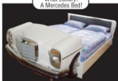
What Luxury! A Mercedes Bed!