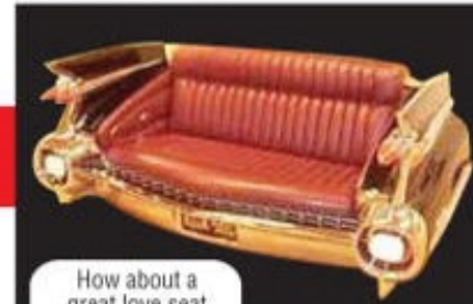
How about a great love seat from a 1959 Cadillac?