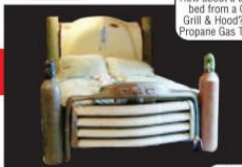
How about a unique bed from a GMC Grill & Hood? And Propane Gas Tanks!!