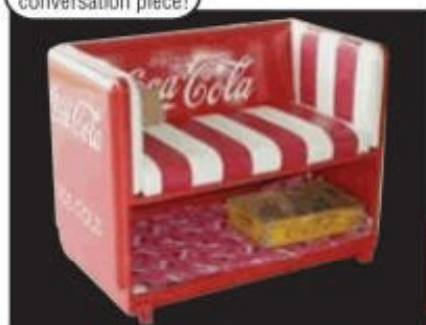
An old Coke Cooler makes a nice conversation piece!