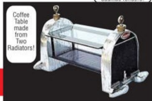
Coffee Table made from Two Radiators!