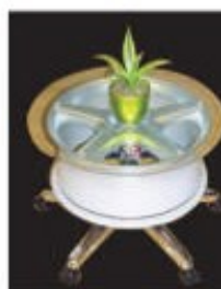
Table made out of a mag wheel with glass on top!