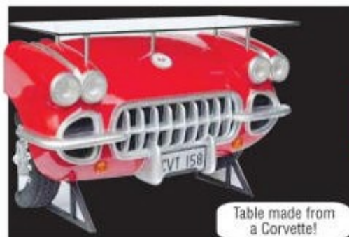
Table made from a Corvette!