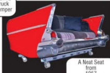
A Neat Seat from 1957 Chevy's fenders!