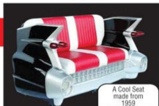
A Cool Seat made from 1959 Cadillac fenders!