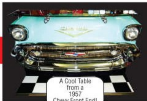
A Cool Table from a 1957 Chevy Front End!