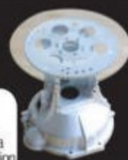
Table made out of a transmission & flywheel with glass on top!

If you have old car parts out in your yard, or stuffed away in the barn, then I have found a way to recycle them into useable pieces of furniture or art displays!