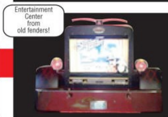
Entertainment Center from old fenders!