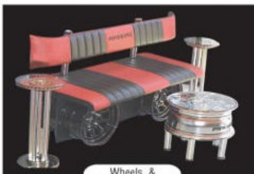
Wheels, & other parts make a complete setting!

I thought a lot of these were very good ideas and could continue our love of cars a for long time!! Great "Man Cave" items! Check them out and see what you think!!