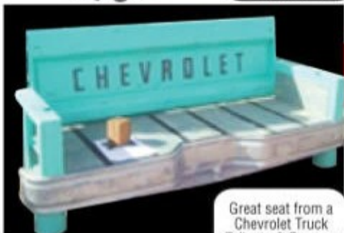
Great seat from a Chevrolet Truck Tailgate & Bumper