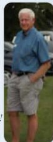
Submitted by: Bill Potts