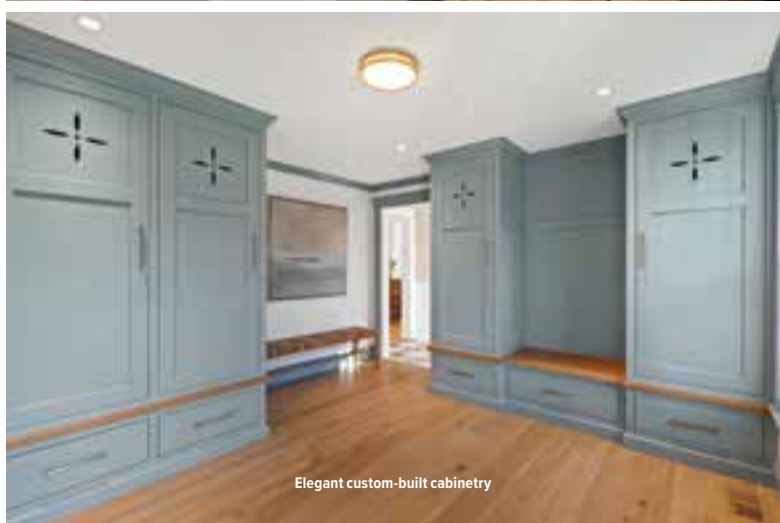
Elegant custom-built cabinetry