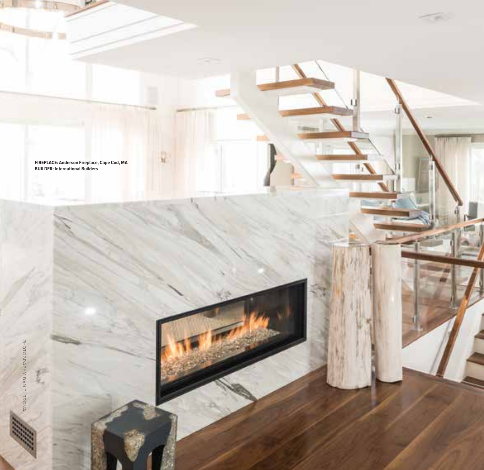
FIREPLACE: Anderson Fireplace, Cape Cod, MA BUILDER: International Builders