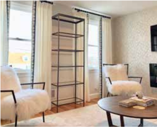
Lara Friedman Design