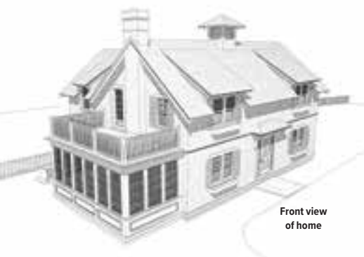
Front view of home

This structure was originally built as a horse barn in the early 1900s and shared an oceanfront property with an old Minot Beach summer cottage. Approximately 75 years ago, the house was relocated to an adjacent lot and transformed into a livable cottage for family members. It's time once again that this home be instilled with new life. To complete the newest of Pratt's projects, his team has gutted and lifted the property to install a full foundation beneath the home. With two beautiful additions off the south and west sides of the house, the new home provides the current family with a primary residence that has more space and affords modern amenities, while the exterior retains its period cottage persona.