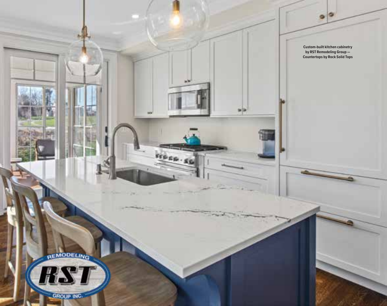
Custom-built kitchen cabinetry by RST Remodeling Group — Countertops by Rock Solid Tops