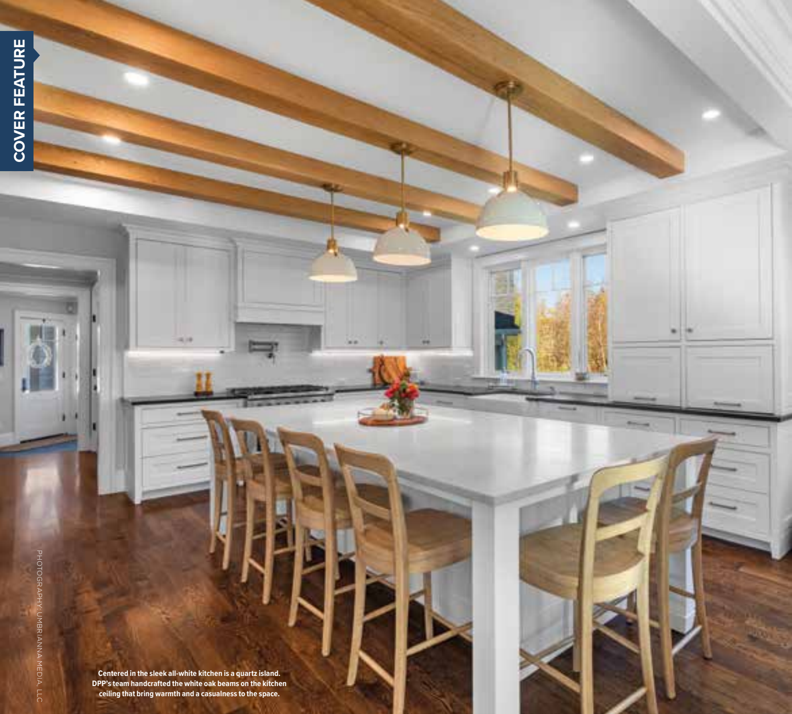
Centered in the sleek all-white kitchen is a quartz island. DPP's team handcrafted the white oak beams on the kitchen ceiling that bring warmth and a casualness to the space.