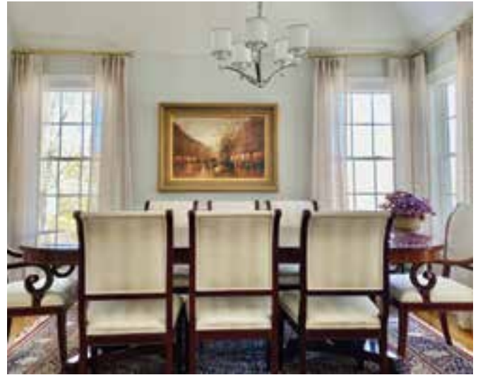
Kimberly Lipka—the Eye of Design Interiors