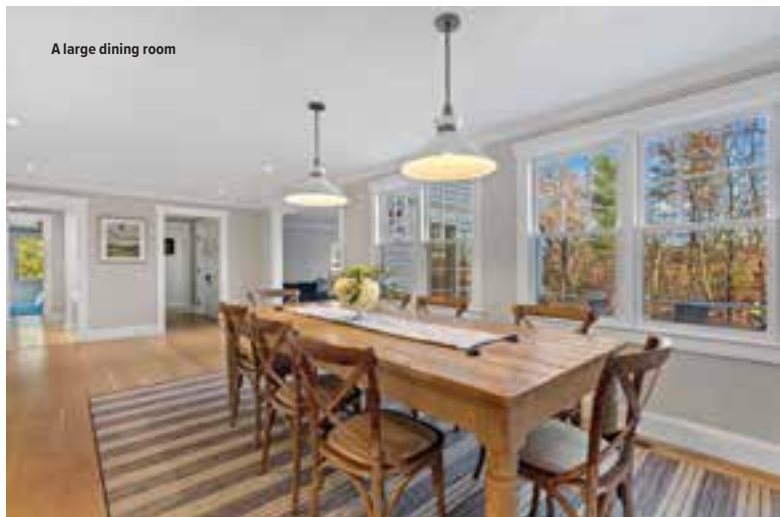
A large dining room