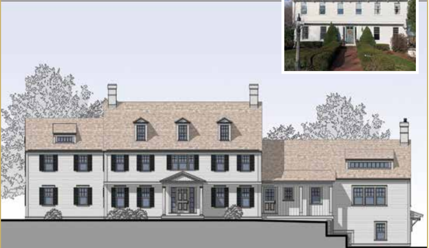
Rendering by Campbell | Smith Architects