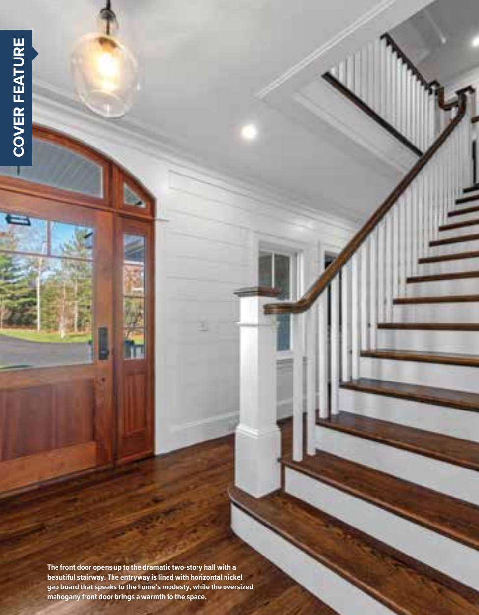
The front door opens up to the dramatic two-story hall with a beautiful stairway. The entryway is lined with horizontal nickel gap board that speaks to the home's modesty, while the oversized mahogany front door brings a warmth to the space.