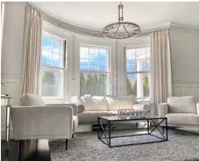
Deb Ellis Designs