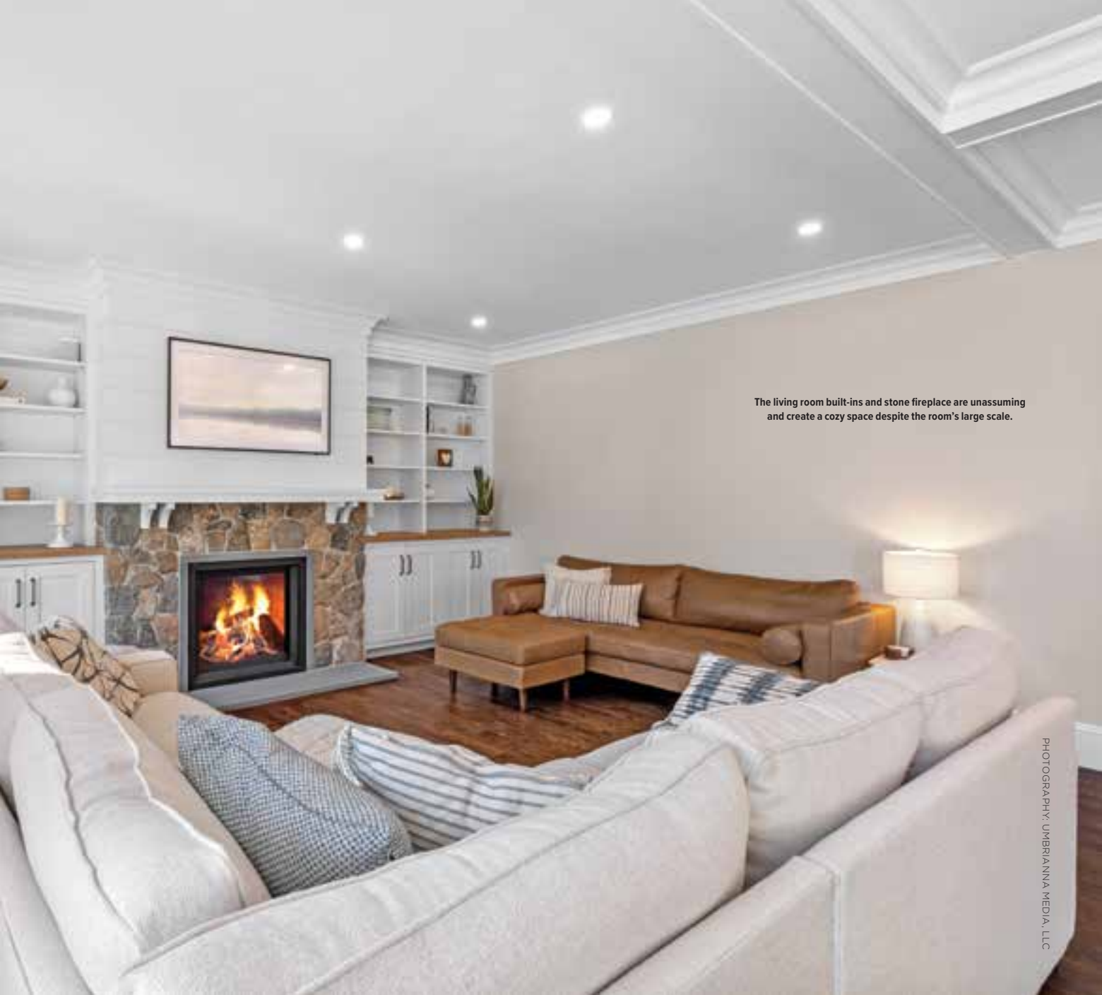
The living room built-ins and stone fireplace are unassuming and create a cozy space despite the room's large scale.