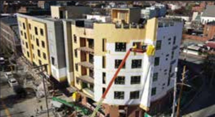
Serrano & Serrano Construction Lawrence, MA