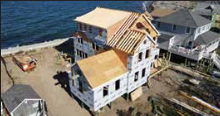
Hub Construction & Maintenance Company Hull, MA