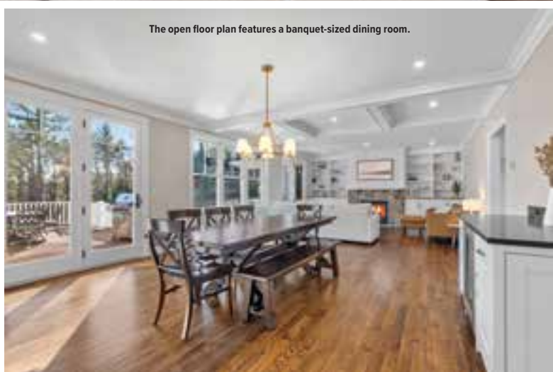
The open floor plan features a banquet-sized dining room.