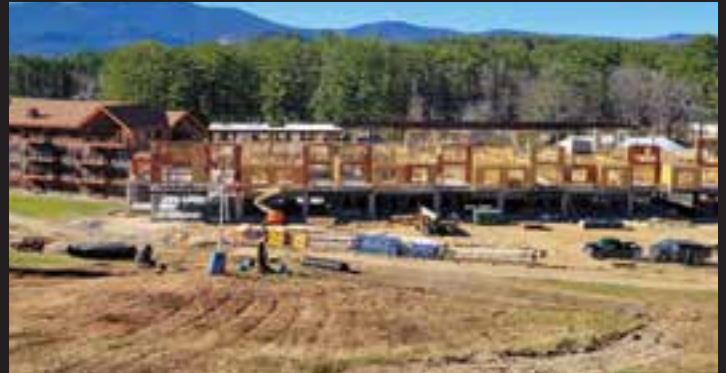
Atlantic Construction Group Cranmore Resort, NH