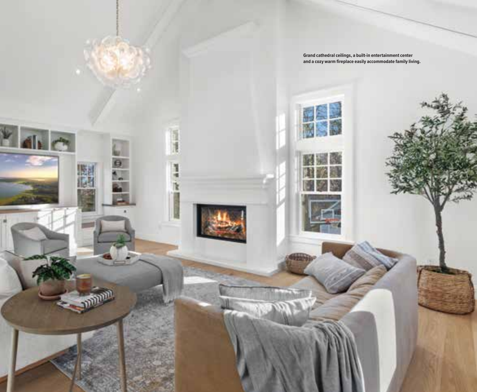
Grand cathedral ceilings, a built-in entertainment center and a cozy warm fireplace easily accommodate family living.