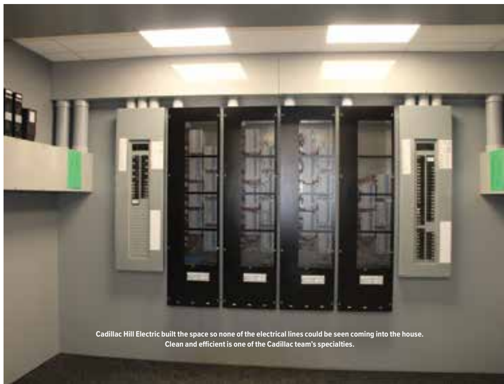
Cadillac Hill Electric built the space so none of the electrical lines could be seen coming into the house. Clean and efficient is one of the Cadillac team’s specialties.