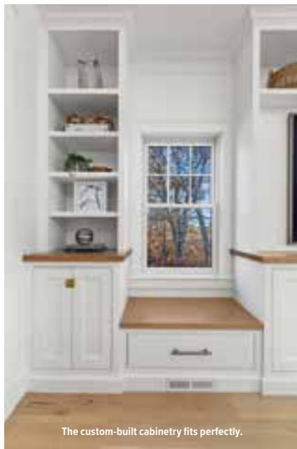
The custom-built cabinetry fits perfectly.