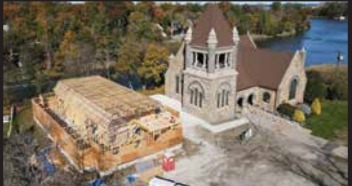
Nike Construction Services Cohasset, MA