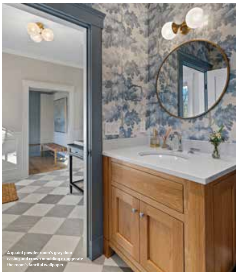
A quaint powder room's gray door casing and crown moulding exaggerate the room's fanciful wallpaper.