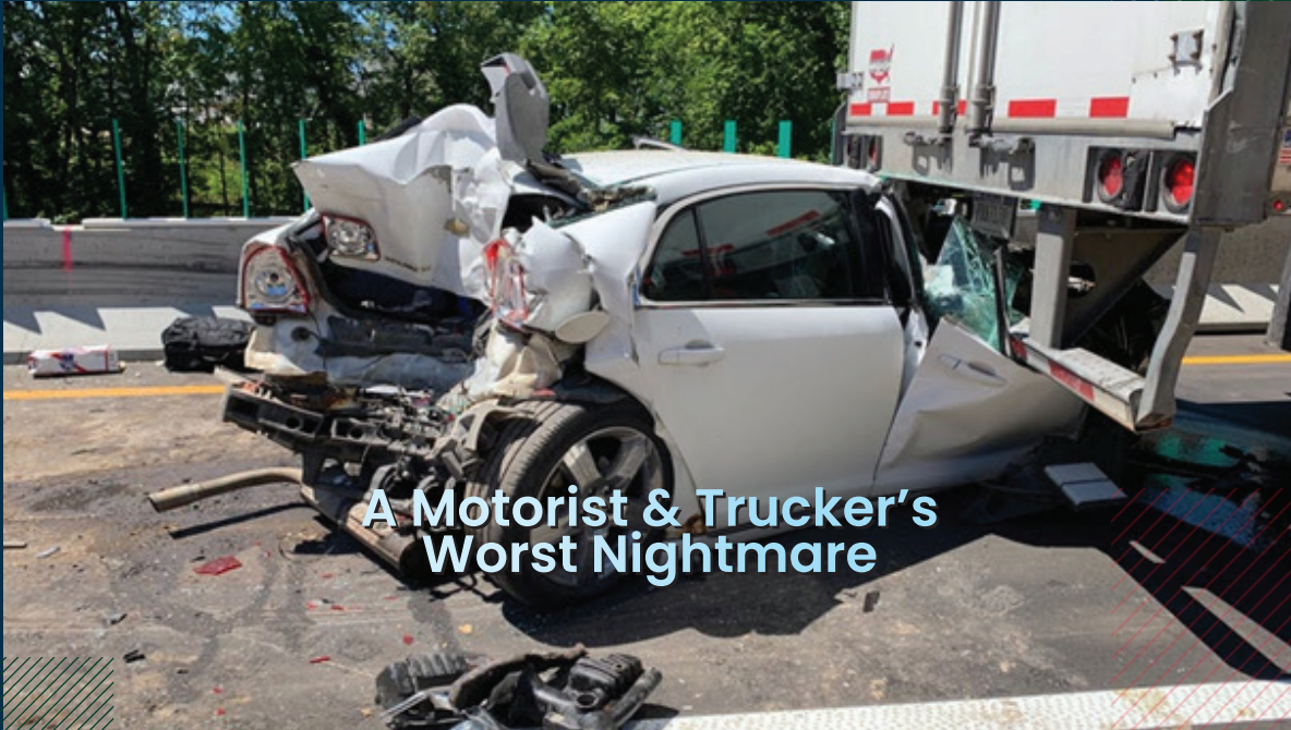
A Motorist & Trucker's Worst Nightmare

IMAMS – REVOLUTIONIZING SEMI-TRUCK SAFETY WITH ITS HIGH-TECH ACCIDENT AVOIDANCE MESSAGING.