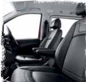
Leather seats with contrast stitching (Sport-X)