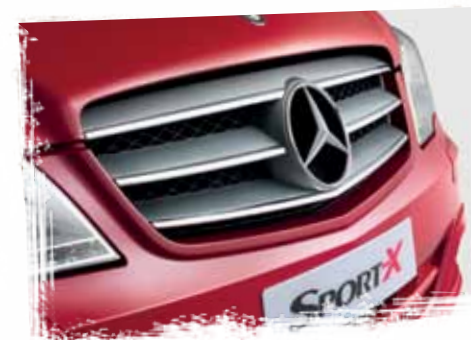
Aggressive BRABUS-designed chrome front spoiler as featured on Sport-X.