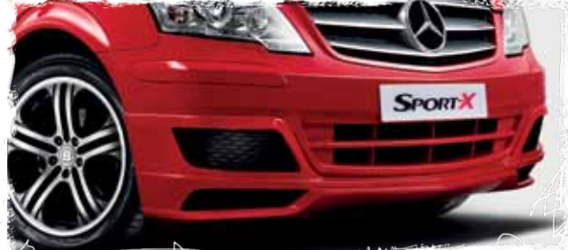
All new custom designed BRABUS front spoiler (Sport-X)