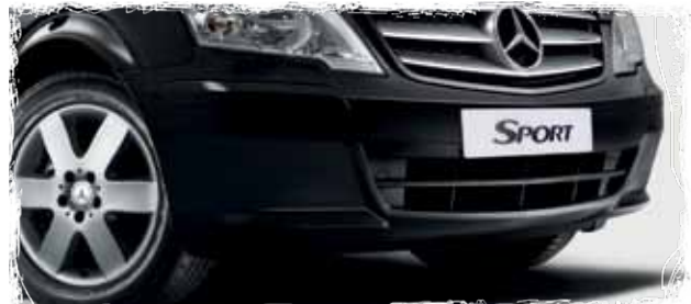
Colour coded bumper (Vito Sport)