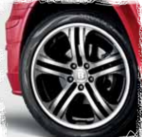
All new BRABUS 18" alloy wheels (Sport-X)