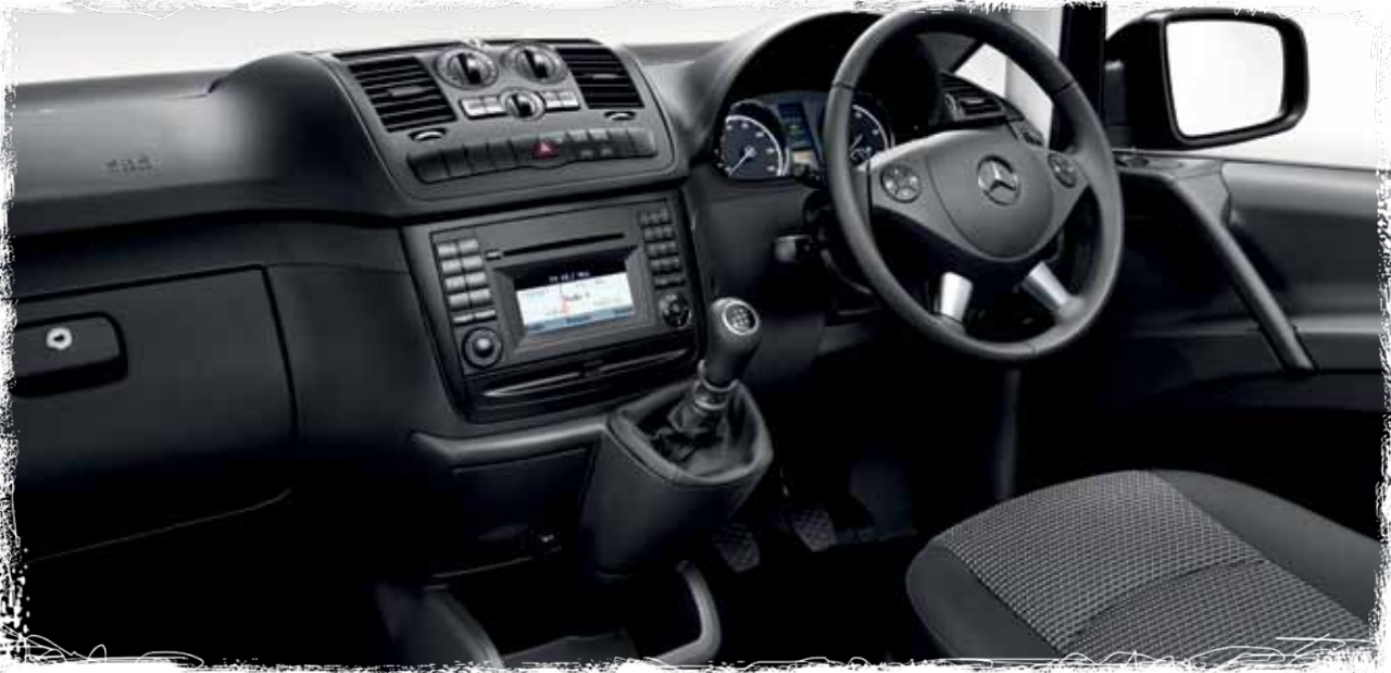
Vito Sport interior