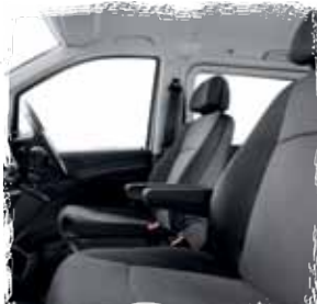
Comfort seats (Vito Sport)