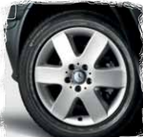
17" 6 spoke alloy wheels (Vito Sport)