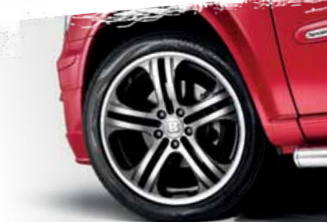
Sport-X includes stylish 18" BRABUS alloys.