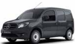
Tenorite grey metallic