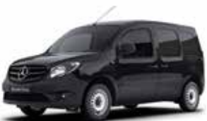
Dravite black metallic