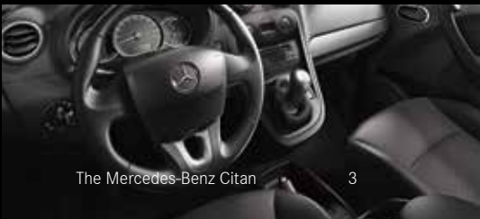
The Mercedes-Benz Citan 3