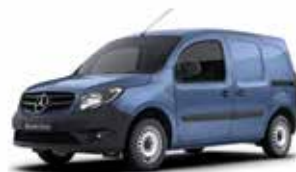
Kornelite blue metallic