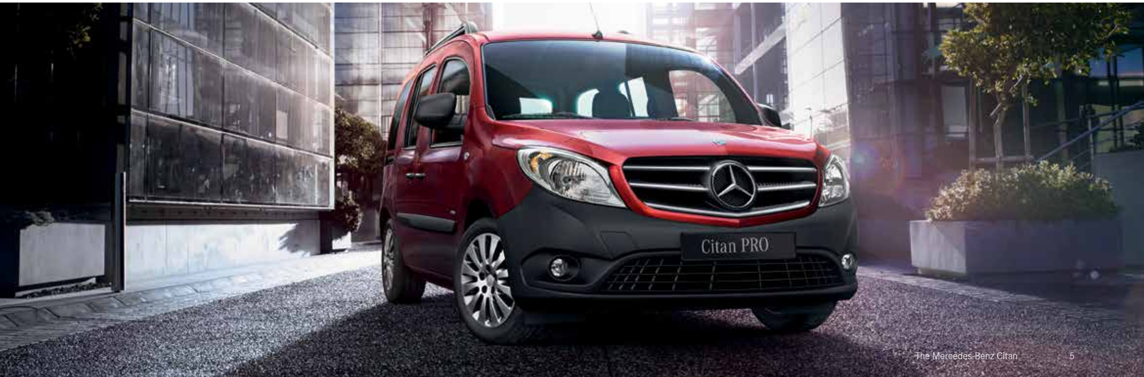
The Mercedes-Benz Citan

*For a full list of exclusions and all product terms please visit mbvans.co.uk/mobilovan