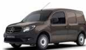
Limonite brown metallic