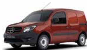
Bornite red metallic