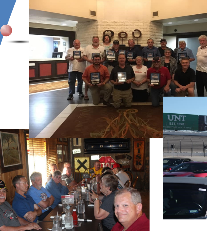
Looky at all of Those OCC winners!

Fun times with the OCC all over the country. 'See the U.S.A in your Chevrolet'