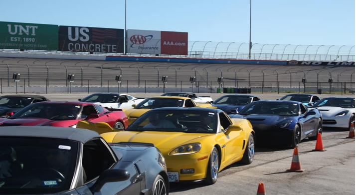
Off to the Races!