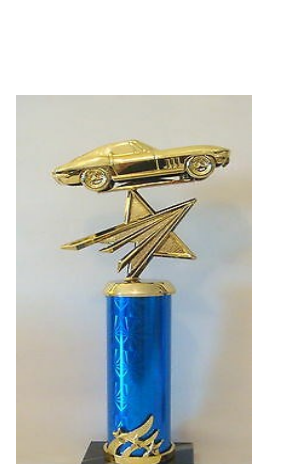
The Jim Butler Chevrolet Car Show is coming soon!

October 20- Sign up now! See Page 5 for all of the juicy details.