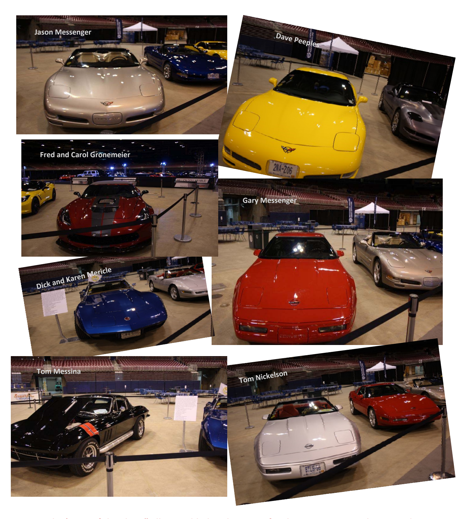
The 'Stars of the Show" all assembled at the Dome for the St. Louis Auto Show 2021! A huge heartfelt THANK YOU to all who brought your Corvettes out and worked the Show.