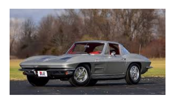
A very rare 1963 Z06 Tanker

A 36 gallon fuel tank, the largest ever offered, was available as an option in the Corvette from 1963 to 1967.