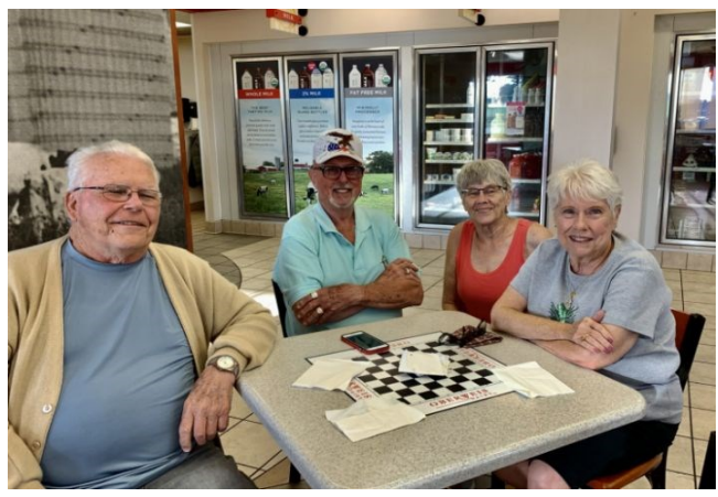
It's HOT and Ice Cream hits the SPOT