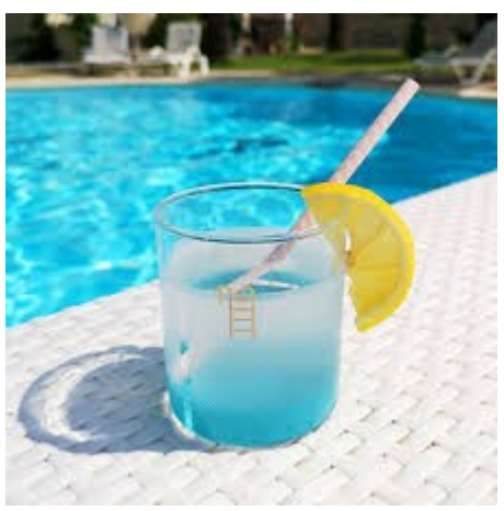
Hello Summer Time!