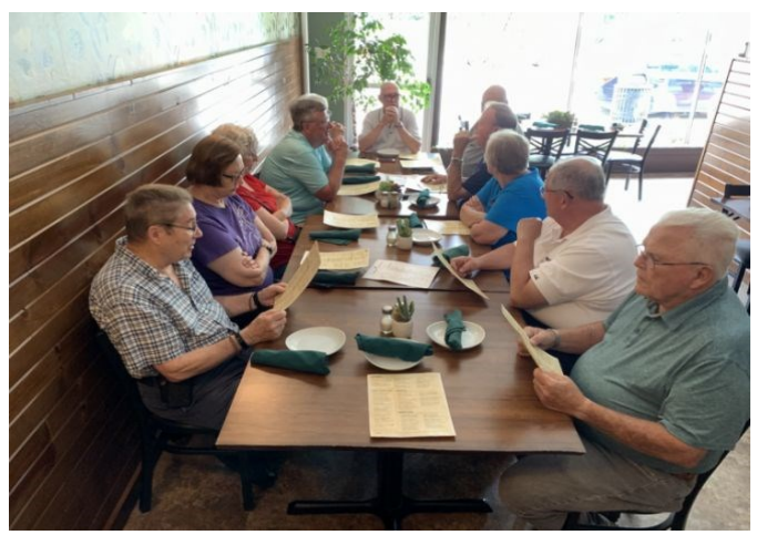
Getting their "Drink On' at the Witness Distillery!