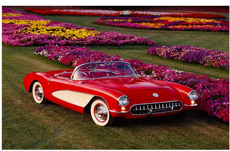
Spring Time equals Top Down!