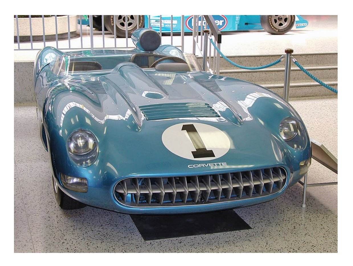
Above: The 1957 Chevrolet Corvette SS at the Indianapolis Motor Speedway Museum.

When the order finally fell, engineers and designers had just six months to build the car before the next 12 Hours of Sebring. Ultimately the car was to race the 1957 24 Hours of Le Mans. The original mule car utilized a custom Mercedes 300 SL chassis. The Jaguar D-Type inspired it's fiberglass body design. The full-spec car had a magnesium body, unlike the mule or production Corvettes. During testing, however, drivers found the fiberglass did a better job of insulating against excessive engine heat in the cockpit. Final drive train elements included 283 small block V8, a Borg Warner 4 speed manual transmission and 4-wheel drum brakes. It measured 168 inches and weighed just 1,850 pounds.