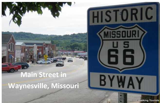
Main Street in Waynesville, Missouri