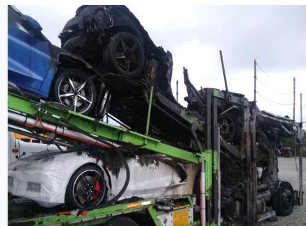
Dateline: Oct. 5, 2021—A transport filled with brand new C8 Corvettes burned to the ground. Nashville, TN.