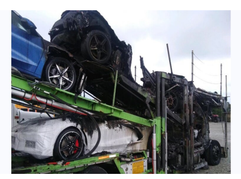
Dateline: Oct. 5, 2021-A transport filled with brand new C8 Corvettes burned to the ground. Nashville, TN.