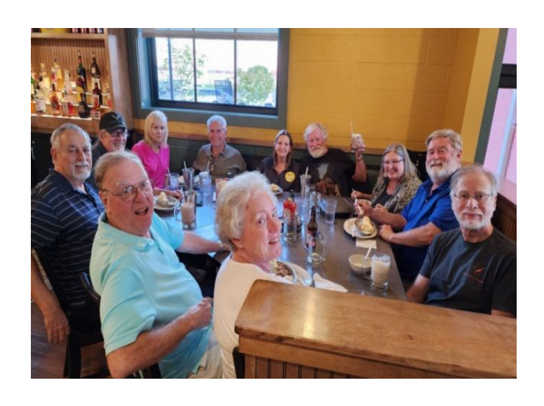
Check GroupWorks for upcoming Sundaes on Sunday!