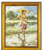
24: Attr to Fernando Cueto Amorsolo (Philippines, 1892-1972) Oil on Canvas Painting, Young Woman Sowing Rice

Artist, Year, Title: Manet? French, Bathers on the River bank Origin: Europe, French Medium: Oil on Canvas Dimensions: with frame 27.5"x 35.5" in | without frame 30"x21.5" Weight: 8.4 lb Provenance: Private Collection Additional Information: Signature "Manet" Lower left. Description: A serene scene depicting 4 females figures: A nude woman seated in the foreground arranging her hair, another partially draped figure reclining on a blanket, and two bathers immersed in the water beyond. The composition recalls the theme of leisure and natural beauty popular among Impressionist painters, rendered with soft, atmospheric brushwork and a luminous palette.