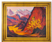
26: Shambhalla Russian Attr to Nikolay Roerich Oil on Canvas Painting

Artist, Year, Title: Attr to Egon Schiele (Austria, 1890-1918), Lovers Origin: Austria Medium: Oil on canvas Dimensions: With frame: 28"x41.5" mm. Without frame: 23"x37.5" mm. Weight: 10.3 lb Provenance: Private Collection Additional Information: The artwork is signed "Egon Schiele 1917" in the lower right corner. However, given that Schiele died in 1918. Description: This dynamic oil on canvas depicts two lovers in a passionate embrace, executed in the distinct Expressionist style of Egon Schiele. Bold, gestural outlines and a raw, emotionally charged palette define the figures entangled form against a swirling background of ochre and ivory. The work captures Schiele's intense psychological and physical expression.