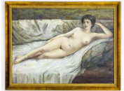
22: Russian Painting Attr to Ilya Repin (1844 - 1930), Nude Woman, Oil on Canvas

Artist, Year, Title: Attr to Ivan Aivazovsky (Russian, 1817 - 1900), Stormy Sea with Ship Origin: Continental Europe Medium: Oil on Canvas Dimensions: with frame 32" x 44" in | without frame 24"x36" Weight: 15.6 lb Provenance: Private Collection Additional Information: Signed lower right. This painting is in the style of Ivan Aivazovsky's marine composition. Framed on gold-tone frame. Description: A dramatic scene with a tall ship navigating rough seas beneath a moonlit sky. The composition echoes Aivazovsky's famous romantic seascapes.