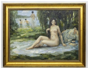
23: Signed Manet ? French European Painting Oil on Canvas

Artist, Year, Title: Attributed to Ilya Repin (1844-1930), Nude Woman Origin: Russia Medium: Oil on canvas Dimensions: with frame 45 x 34.5 in | without frame 40"x30" Weight: 10.1 lb Provenance: Private Collection Additional Information: Signed by "Repin". He is regarded as one of the most celebrated Russian realist painters, renowned for his portraits and genre scenes. This work is attributed to Repin; professional authentication is recommended prior to purchase. Description: A finely rendered oil painting depicting a reclining nude woman on draped white and patterned fabrics. The composition is notable for its naturalistic modeling, delicate skin tones, and serene expression, characteristic of the artist's approach to portraiture. Signed lower right. Presented in an ornate gilt frame.