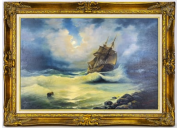
21: Attr to Ivan Aivazovsky (Russian, 1817 - 1900), Stormy Sea with Ship, Oil on Canvas