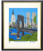
24: John Suchy (American, b. 1946), The George Washington Bridge, NYC, Ltd. 327/400 Etching on paper

Artist, Year, Title: NoÃ«l (20th Century), Cirque NouveauMedium: Mixed media with metallic accents, framedDimensions: Framed 33" x 35.5"Provenance: Private collection, United StatesAdditional Information: Sign æœNoÃ«l? lower right. A vibrant mixed-media combining abstract forms, figurative elements, and metallic highlights. Professionally matted and presented in a contemporary silver-tone frame.Description: A dynamic and richly textured composition depicting an abstract circus scene with equestrian and acrobatic figures. The artist blends soft washes, layered geometric shapes, and shimmering metallic tones to create a sense of rhythm and movement. The work reflects a modern, imaginative interpretation of classic circus themes.