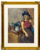
68: Guy Pène du Bois (American, 1884 - 1958) Seated Woman with Hat, 1953, Oil on Board

Artist, Year, Title: David Davidovich Burliuk (Russian-American, 1882-1967), Girl with Balloon, mid-20th centuryMedium: Oil on boardDimensions: Framed 24" x 30"Provenance: Private collection, United StatesAdditional Information: Bears signature of Burliuk lower right. David Burliuk was lived in New York, Russia, Ukraine, and China and is widely recognized as the "Father of Russian Futurism," celebrated for his expressive color, bold forms, and dynamic compositions. This artwork is offered without a certificate of authenticity and is sold as is. Description: A vibrant and expressive composition depicting a young girl in a yellow dress reaching toward an orange balloon, set against an abstracted landscape of rhythmic brushstrokes and bright, warm tones. Burliuk's characteristic use of saturated color, textured surfaces, and stylized figures creates an energetic, playful atmosphere while maintaining his modernist sensibility.