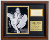
19: Marilyn Monroe, Framed Display, Printed photograph and printed signature

Artist, Year, Title: Takeshita Kin'û (Japanese, active circa 1930sâ€“1950s), Floral Cart with ChildMedium: Acrylic on fabric (painted textile), framedDimensions: Framed 16" x 20"Provenance: Private collection, United StatesAdditional Information: Signed with a red artist seal mark lower right. Takeshita Kin'û is known for finely rendered decorative paintings on silk and fabric, often depicting children, floral arrangements, and traditional motifs. Executed in a rich palette with exquisite detail characteristic of mid-20th-century Japanese decorative art. Offered without a certificate of authenticity and sold as is.Description: A beautifully detailed composition by Takeshita Kin'û, featuring a young child in traditional attire standing beside an ornate floral cart overflowing with blossoms. The artist combines precise linework, vibrant colors, and elegant textile texture to create a harmonious decorative scene. The stylized frame design surrounding the subject adds balance and refinement to the overall composition.