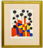
39: A. Calder (American) Geometric Composition, Lithograph

Artist, Year, Title: Viktoria Volynets (Ukrainian/American), FemininityMedium: Oil on canvas with gold patelDimensions: 30" x 40"Provenance: Private collection, United StatesAdditional Information: Original artwork. Title "Femininity" and the artist's signature are written on the back of the canvas.This piece is part of Volynets's conceptual figurative series celebrating feminine energy, spiritual transformation, and the anatomical beauty of the human form.This artwork is offered without a certificate of authenticity and is sold as is.Description: A vibrant and symbolic portrayal of the female form, blending anatomical realism with surreal, cosmic, and botanical elements. The figure emerges from a swirling, otherworldly landscape, adorned with luminous painted flowers, celestial textures, and shimmering gold patel accents. The artist explores themes of feminine power, sensuality, and mysticism, creating a visually rich and emotionally resonant composition.