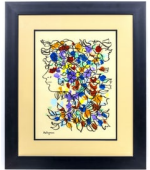
40: Rene Portocarrero (Cuban, 1912-1985), Cabeza Floral, 1971, Mixed Media on Paper

Artist, Year, Title: Style of A. Calder (American) Geometric Composition, mid-20th centuryMedium: LithographDimensions: Framed 22" x 19"Provenance: Private collection, United StatesAdditional Information: Bears pencil-sign "Calder" lower right lower left. This artwork is offered without a certificate of authenticity and sold as is. The bold colors and geometric abstraction reflect Calder's signature style as seen in his mobiles and graphic works.Description: A striking serigraph in vibrant primary colors red, yellow, blue intersected with dynamic black linear forms and circular motifs reminiscent of Calder's kinetic sculptures. The balanced arrangement, strong contrasts, and rhythmic geometry evoke the playful yet precise visual language characteristic of Calder's graphic oeuvre.