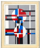
41: Sandu Darie (Romanian/Cuban, 1908-1991) Geometric Abstraction, Oil & Acrylic on Canvas Painting

Artist, Year, Title: Ren  Portocarrero (Cuban, 1912 1985), Cabeza Floral, 1971Medium: Mixed media on paper (ink and gouache)Dimensions: Framed 31.5" x 37"Provenance: Private collection, United StatesAdditional Information: Bears Signature "Portocarrero 71" lower left. This artwork is offered without a certificate of authenticity and is sold as is.Description: A striking portrait composition featuring a stylized profile surrounded by an explosion of colorful floral and abstract forms. The lively interplay of gouache color patches and fluid ink outlines exemplifies Portocarrero's signature approach merging portraiture with ornamental abstraction to create a rhythmic, expressive image rich in Caribbean vibrancy.