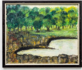
52: Walter Leistikow (European) Landscape, Oil on Canvas Painting