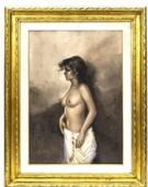
31: Italian School, Standing Nude with Drape, Oil on Canvas Painting