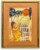
67: David D. Burliuk (Russian-American, 1882-1967) Girl with Balloon, Oil on Board