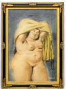
30: After Fernando Botero (Colombian, 1932-2023), Nude with Yellow Drape, 1990, Oil on Canvas

Artist, Year, Title: After Fernando Botero (Colombian, 1932â€”2023), Interior Scene, 1988Medium: Oil on canvasDimensions: Framed 35.5" x 45.5"Provenance: Private collection, United StatesAdditional Information: Bears signature â€œBotero 88? lower right. This artwork is offered without a certificate of authenticity and is sold as is. Presented in an ornate gilt frame.Description: A lively interior composition executed in the manner of Fernando Botero, featuring the artistâ€™s well-known voluminous figures engaged in a humorous and exaggerated domestic scene. The warm palette, rounded forms, and narrative energy reflect characteristics commonly associated with Boteroâ€™s iconic figurative style.