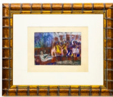
54: Erick Heckel (Germany) 1966, Mixed media on paper