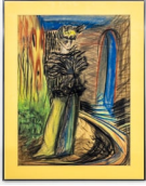
28: Ben Medina (American), Abstract Figure in Interior, 1979, Mixed media on paper