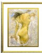
32: Arina Sleutsker Female Nude, ca. 2000s, Ltd. 1/195, Serigraph on paper

Artist, Year, Title: Italian School, Standing Nude with Drape, mid?20th centuryMedium: Oil on canvasDimensions: Framed 27" x 29"Provenance: Private collection, ItalyAdditional Information: Bears an indistinct Italian-style signature lower left. Presented in an ornate gilt Italian frame with linen liner. Strong classical influence with soft tonal modeling and realistic anatomical treatment.Description: A refined mid-century Italian School nude, portraying a partially draped female figure rendered with delicate realism and subtle chiaroscuro. The artist employs warm earth tones, soft transitions, and a muted atmospheric background, giving the composition an elegant, timeless quality.