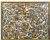
22: Max Schacknow (American, 20th Century), A Touch of Bronze, 1990, Acrylic on Canvas Painting

Artist, Year, Title: Abstract Collage, The Wall Street Journal, n.d.Medium: Mixed media collage on canvas, framedDimensions: Framed 11" x 13"Provenance: Private collection, United StatesAdditional Information: Signed lower right. Reverse with original Grumbacher canvas stamps. A dynamic mixed-media work incorporating layered Wall Street Journal newsprint fragments combined with expressive paint applications for added depth and texture.Description: A visually striking mixed-media collage featuring overlapping newspaper elements, including The Wall Street Journal, integrated with bold brushstrokes and abstract tonal layering. The piece blends collage techniques with painterly expression, creating a contemporary composition with rich surface detail. Presented in a complementary modern frame.