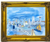
10: Attr to Raoul Dufy (French) Harbor Scene with Sailboats, Oil on Canvas Painting