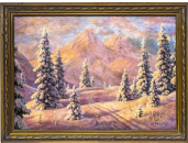
44: Russian Landscape, Signed Iw.P. Choultse?, Oil on Canvas Painting

Artist, Year, Title: Wassily Kandinsky (Russian, 1866?1944), Abstract Composition, 1941Origin: EuropeMaterial: Mixed media on board, framedDimensions: Framed: 30 x 23 in, Unframed: 21 x 28 inAdditional Information: Bears signature ?K 41? lower right. This item is sold as is, not authenticated, and is offered as is.Description: Vivid geometric abstraction featuring intersecting shapes and bold color fields of blue, green, yellow, and red. The composition demonstrates rhythmic balance and dynamic motion reminiscent of Kandinsky's late non-objective works.