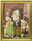
29: After Fernando Botero (Colombian, 1932-2023), Interior Scene, 1988, Oil on Canvas Painting