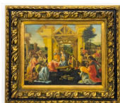
73: Attr to Sandro Botticelli (Italian, 1445-1510), The Adoration of the Magi, Oil on Board Painting