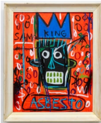
26: Jean-Michel Basquiat, Asbesto 1982, Acrylic and Oil stick on Canvas

Artist, Year, Title: Grammie Leo Leone Ardo, Pike Place Fish, SeattleMedium: Color print (reproduction), framedDimensions: Framed 15" x 12"Provenance: Private collection, United StatesAdditional Information: Printed artwork featuring the artistâ€™s signature style with playful, colorful imagery of Seattleâ€™s iconic Pike Place Fish Market. Signature æœLeo? appears in the print. Presented in a natural wood frame.Description: A vibrant and whimsical print depicting the lively Pike Place Fish Market in Seattle. The composition features cheerful characters, flying fish, bold lettering, and bright decorative elements, capturing the energetic and humorous spirit of this famous landmark. The work reflects Grammie Leo Leone Ardoâ€™s imaginative illustrative style.