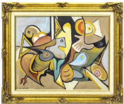
42: Arshile Gorky (American) Abstract Composition, Oil on Canvas Painting

Artist, Year, Title: Sandu Darie (Romanian/Cuban, 1908/1991), Geometric AbstractionOrigin: CubaMedium: Oil or mixed media on canvasDimensions: 34" x 42.5" (canvas and framed)Provenance: Private collection, United StatesAdditional Information: Bears signature "Darie" lower right. This item is offered without a certificate of authenticity and is sold as is.Description: A vibrant geometric abstract composition by Sandu Dari , a pioneering figure in Cuban modernism and a key contributor to the international Concrete Art movement. The work reflects Dari 's mature visual language, characterized by intersecting planes, bold colors, and rhythmic balance. His compositions often integrate principles of kineticism and constructivism. As a member of Los Diez Pintores Concretos (The Ten Concrete Painters), Dari  played a central role in avant-garde abstraction in Cuba during the 1950s.