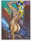
38: Viktoria Volynets (Ukrainian/American), Femininity