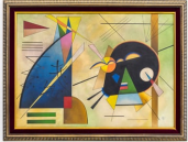
43: Wassily Kandinsky (Russian) Abstract Composition, 1941