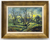
59: Charles Burchfield (American, 1893-1967) Sunlit Grove, Tempera on Board

Artist, Year, Title: Attributed to Jack Whitten (American, 1939?2018), Untitled Abstract, late 20th centuryMedium: Acrylic on boardDimensions: Framed 20" x 16.5"Provenance: Private collection, United StatesAdditional Information: Bears signature ?Jack Whitten? lower right. Jack Whitten was active lived in New York and is known for abstract mosaic-like paintings, African-American cultural themes, and carved wooden sculptures. This artwork is offered without a certificate of authenticity and is sold as is.Description: A vibrant abstract composition featuring layered strokes of acrylic in deep blues, greens, blacks, and luminous yellow tones. The painting?s gestural energy and textured surface evoke Whitten?s experimental approach, where motion, rhythm, and atmospheric depth play central roles.