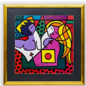
27: Romero Britto (Brazilian-American, b. 1963), Couple, 1976, Hand-Sign Print

Artist, Year, Title: Attributed to Jean-Michel Basquiat (American, 1960â€“1988), Asbesto, 1982Origin: United StatesMedium: Acrylic and oil stick on canvas, framedDimensions: 20" x 24" framed; 16.5" x 20.5" unframedProvenance: Private collection, United StatesAdditional Information: Verso inscribed and dated æœNOTARY / JEAN 82 / MICHEL BASQUIAT? with crown motif.Front composition includes the text æœASBESTO? and æœSAMO?, consistent with Basquiat-inspired imagery.This artwork is offered without a certificate of authenticity and is sold as is.Description: A vibrant neo-expressionist composition executed in the manner of Jean-Michel Basquiat, featuring a crowned figure, bold contour lines, symbolic text, repetitive numerals, and layered color fields. The work incorporates graffiti-inspired elements associated with early-1980s East Village street art and Basquiatâ€™s signature iconography.