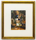
63: Marc-Aurèle Fortin (Canadian) House Among Trees, Watercolor on Paper