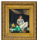
72: P. Norrad (20th Century), Gypsy Girl with Fruit, Oil on Canvas Painting