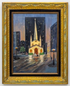
64: In style Ernest Fiene (American) City Church at Night, Oil on Board Painting

Artist, Year, Title: Marc-Aurèle Fortin (Canadian, 1888-1970), House Among Trees, mid-20th centuryMedium: Watercolor on paperDimensions: Framed 20" x 22"Provenance: Private collection, United StatesAdditional Information: Bears signature "M. A. FORTIN" lower right. Marc-Aurèle Fortin was lived in Quebec and Alberta, Canada, and is celebrated for his atmospheric landscapes, bold compositions, and expressive treatment of trees and architecture.This artwork is offered without a certificate of authenticity and is sold as is.Description: A richly atmospheric watercolor depicting a house partially hidden among tall trees, rendered in deep earth tones and dramatic contrasts. Fortin's signature expressive brushwork and rhythmic patterns give the scene a sense of movement and depth, capturing the quiet mood of a wooded Canadian landscape.