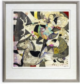
23: Noel (20th Century), Cirque Nouveau, Mixed Media Painting