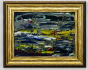
58: Jack Whitten (American, 1939 - 2018) Abstract, Acrylic on board