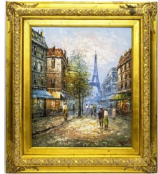
8: Danny, Paris Street Scene with the Eiffel Tower, Oil on Canvas Painting

Artist, Year, Title: G. H. M. Findlay (British, 19th-20th century), Harbor Scene with Boats, 1924 Origin: United Kingdom Medium: Oil on canvas Dimensions: 23 x 19 in. framed, 18 x 14 in. unframed Provenance: Private collection Additional information: Bears signature "G. H. M. Findlay" and dated "7/11/24" lower right. This item is offered without a certificate of authenticity and is sold as is. Description: Charming early 20th-century maritime scene depicting moored sailboats under a luminous sky, rendered in soft tones of blue, gold, and violet. The artist's sensitive treatment of light and reflection captures the tranquil atmosphere of a coastal harbor at sunset.