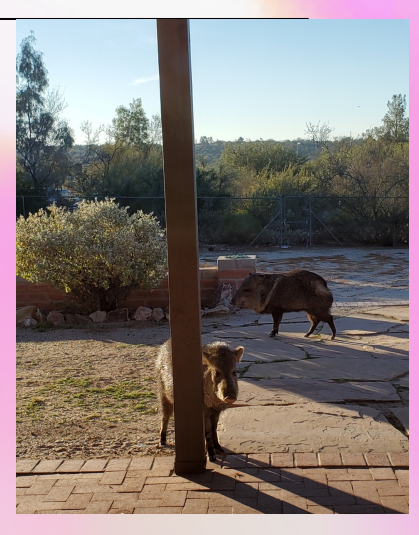
Gems & minerals aren't the only nature you may experience in AZ - wild boars!