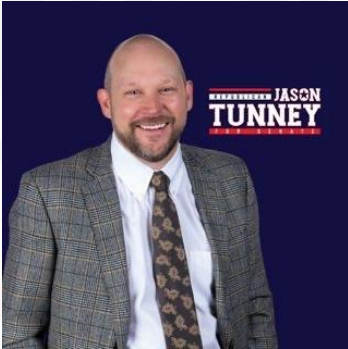
Jason Tunney of Saginaw Twp, Republican

State Senator for 35th District (Bay, Midland, and Saginaw Counties)