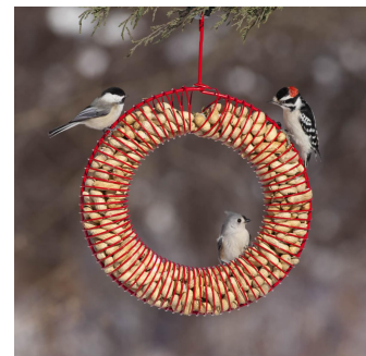
Peanut/Suet Ball Wreath These hanging metal "slinky" wreaths can be filled with a variety of goodies from our whole peanuts to large or small