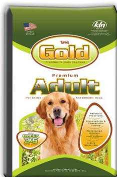
TUFFY GOLD Dog FOOD For active dogs. Includes

BE SURE TO CHECK OUT SOME RECENT ADDITIONS TO OUR INVENTORY