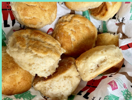
The famous CWA Scones