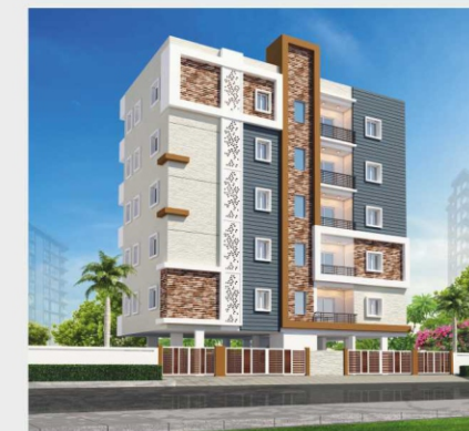
HEMADURGA'S PRIDE @ Road No: 7, Krishinagar, Miyapur 2021