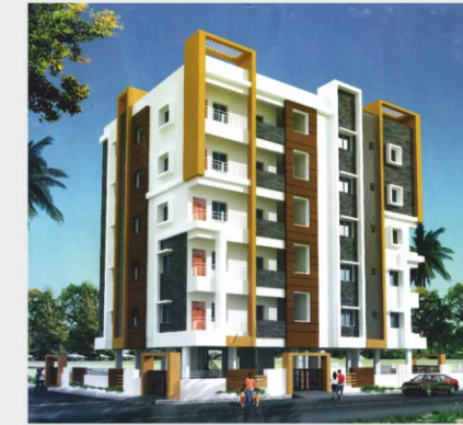
SRI SHIVA SAI NILAYAM @ Sai Ram Nagar, Nalagandla 2017