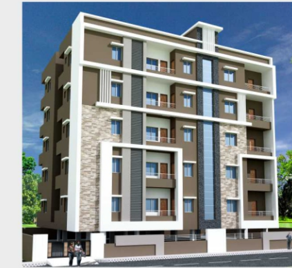
SRI SAI MATHRUSRI ELITE @ Plot Nos: 610&611, Matrusri Nagar, Miyapur, 2018