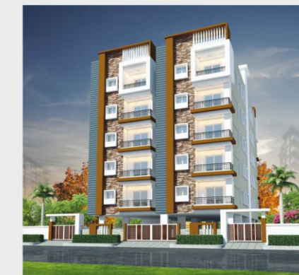
HEMADURGA PRESTIGE @ Road No: 5&6, Krishinagar, Miyapur 2021