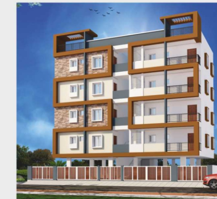
SRI SAI SATYA ELITE @ Rd No: 7, Krishinagar, Miyapur 2020