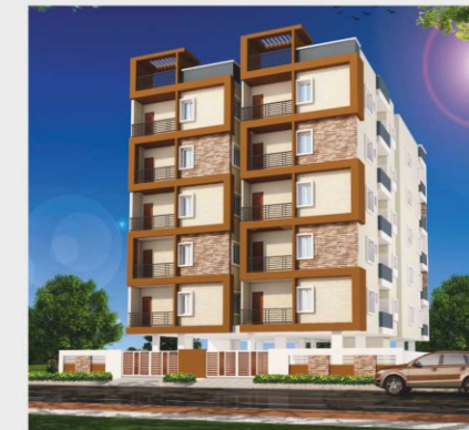
SRI SAI ELITE @ Rd No: 3, Krishinagar, Miyapur 2019