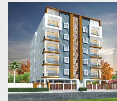
SRI SAI MAHADEVA ELITE @ Mahadevapuram, Gagularamaram, Hyderabad. 2021