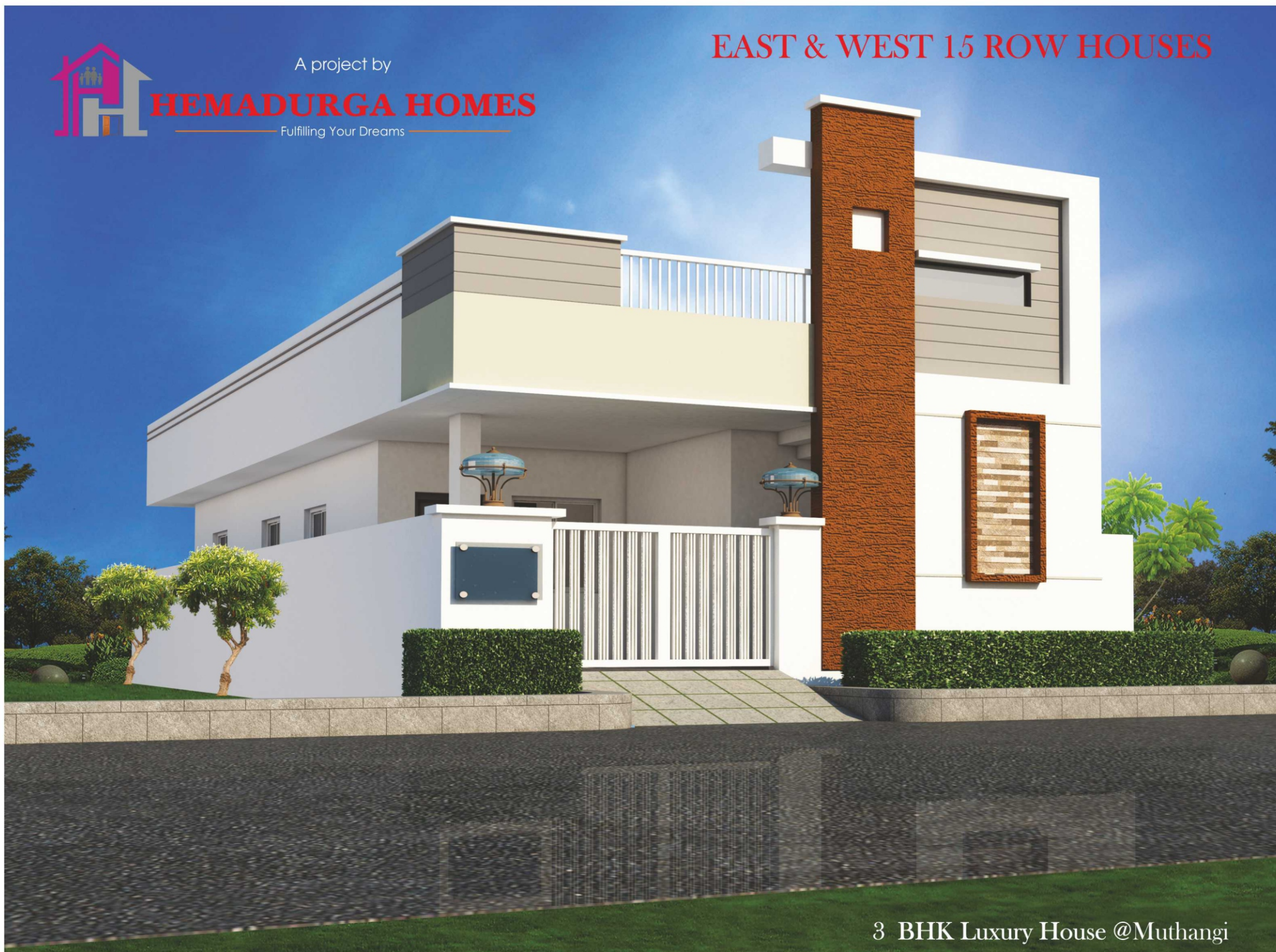
3 BHK Luxury House @Muthangi