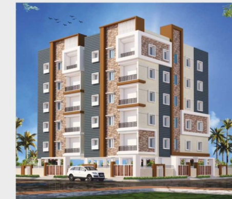
SRI SAI RAM ELITE @ Sai Ram Nagar, Nalagandla 2020