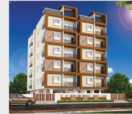
ADI MANOR @ Rd No: 7, Krishinagar, Miyapur 2019