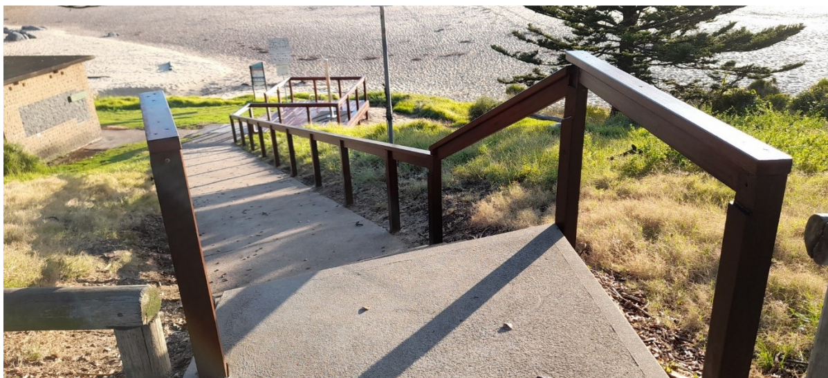
Refurbished Stairway to Coila Beach and new Shower Platform for use by beachgoers

The THPA is now engaged in using its own funds to purchase a non-ferrous Storage Shed at a cost of $1,765 from Bunnings Warehouse to secure the Beach Wheelchair within the precincts of the Tuross beach Holiday Park who will be the custodians of the chair on behalf of the THPA. At our request the Council has kindly removed a dangerously leaning tree that was overhanging the site where the storage shed will be installed.