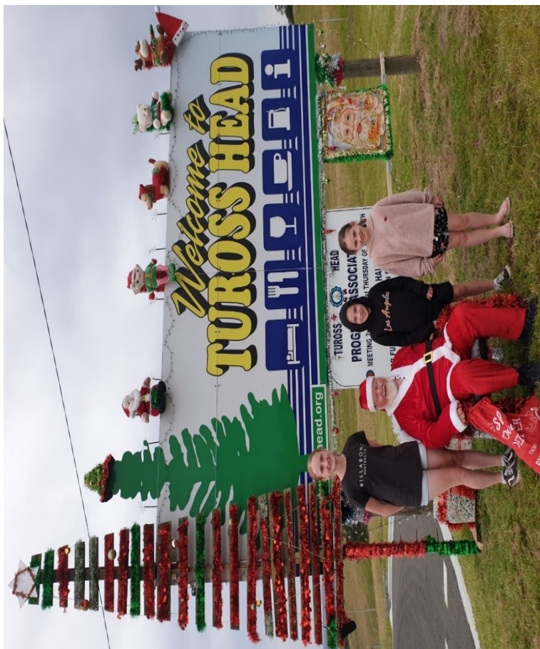
Christmas Eve – when SANTA made it to Tuross Head, not like Christmas in Darwin in 1975!

9. Promoting Christmas Spirit for our Village. As part of the THPA's promotion of the Christmas/New Year festive season, and to build up the community spirit after the THPA – Secretary's Annual Report 2021/2022 (Final)