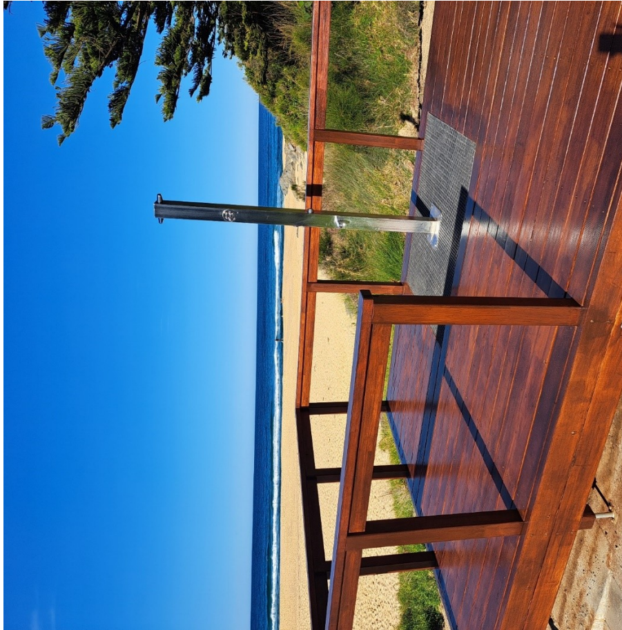
The newly constructed Shower Pad at Coila beach – the room with a colossal view?

22. Refurbishment & upgrade of entrance stairway to Coila Beach. This month, August 2022, the Council has just completed a project that saw the replacement of the dilapidated timber railings along the stairway down to Coila Beach. It has also constructed a new double headed Shower Platform for use by beachgoers to wash of the salt and sand after swimming. Well done to the Council worker bees. The next phase is to demolish the old Toilet Block and construct new Toilet amenities block at Coila Beach in the FY23/24 Operational Plan.