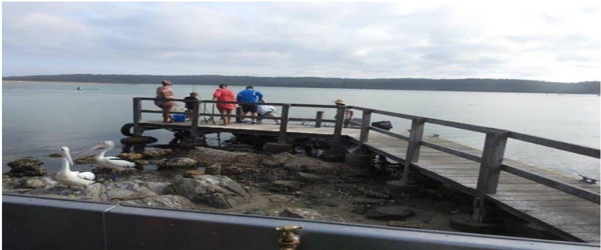
The old Tuross Lake Fishing and Boating Jetty seen in 2019 that has now been replaced in 2022