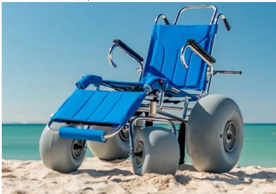
SANDCRUISER – ALL TERRAIN & BEACH WHEELCHAIR being purchased by the THPA

21. Grants funding submission to VARIETY NSW/ACT Club for $5kto enable the THPA to purchase of a replacement BEACH WHEELCHAIR for use by persons with a disability. On 30 Jun 22 the THPA lodged a bid for grants funding, which was successful. On 3 Aug 22 VARIETY NSW/ACT advised the Secretary THPA that the requested $5k had been approved, to enable us to purchase a replacement Beach Wheelchair for use by person with a disability, especially persons under the age of 18 years, to access the beach for entering the water and or to engage in recreational fishing. The Treasurer has already placed an order with the manufacturer for the SANDCRUSER Beach Wheelchair at a cost of $4,799.