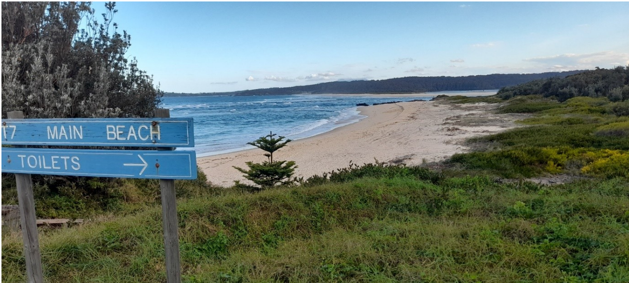
View of Main Beach at Tuross head after the combined Council & RFS volunteer's splendid efforts.