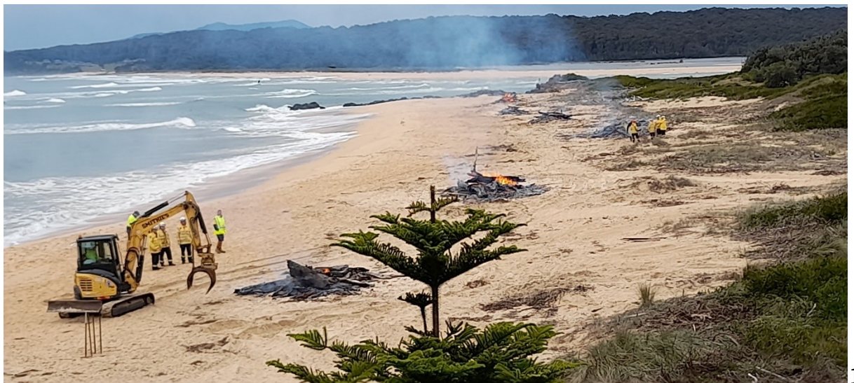
8 Aug 22 - Council and RFS volunteers clearing the closed off Main Beach and burning the resultant woodpiles. Smouldering ashes were extinguished and buried for public safety of beach goers.

14. MAIN BEACH CLEAN-UP OF STORM OUTFLOW DEBRIS. Following THPA lobbying to Warren Sharpe in mid-2021 and again over the Christmas/New Year Council Block Leave period, on their very first morning back at work for 2022 on 4 Jan 22, the Council work crew attended Main Beach and partly cleared the storm and flood timber debris that deposited on sections of the beach from more recent flooding events and king tides, and pushed the debris into wood piles, whereby as requested by the THPA, the Council managed to clear the sandy beachfront of Main Beach for safer use by swimmers given that it is the only Life Savers patrolled beach during the peak holiday and swimming & surfing season.