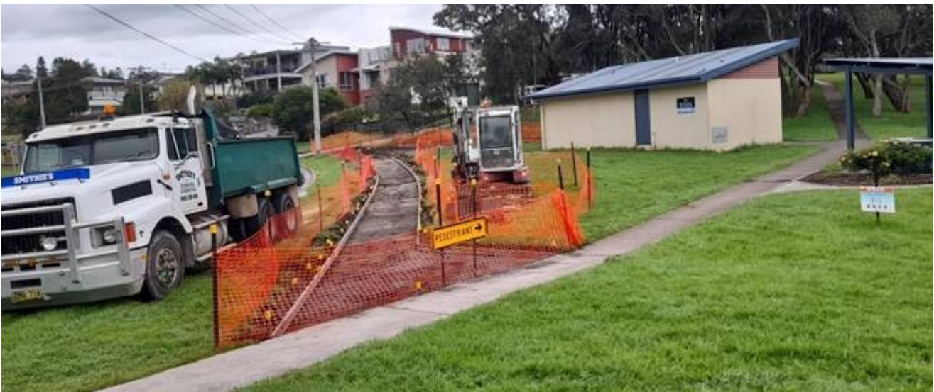
Section of the pathway being constructed along Evans Road from #10 to Tuross Service Station

16. Construction of new Pedestrian Footpath along Evans Road. After lobbying by the TPHA since 2017 through our submission of pathway priorities which was accepted and incorporated into the approved Eurobodalla Shire's 2017 Footpath Strategy. During the months of April & May 2022 the Council has at last completed a project to replace the underground water reticulation pipes and constructed a 1.5-meter-wide Footpath from outside #10 Evans Road up to the Tuross Head Service Station entrance driveway. Further footpath construction and water reticulation pipeline replacement activity is expected to be carried out along Evans Road from the Tavern entrance up to Hawkins Road later this year?