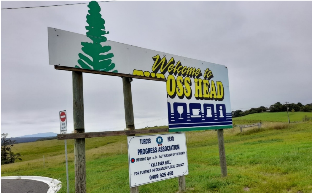
On 2 Feb 22 Bay Signs removed Signboard damaged by Council Mower collision on 21 Jan 22 for repair.

8. Replacement ‘WELCOME TO TUROSS HEAD’ signboard. On Fri 21 Jan 21 the Council mower accidentally collided with the iconic Tuross Head signboard and following THPA – Secretary’s Annual Report 2021/2022 (Final)