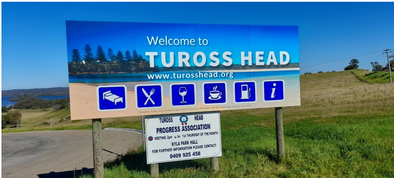
The new "WELCOME TO TUROSS HEAD" signboard was erected on 8 May 22 erected by Council in collaboration with the THPA.

an investigative report by the Secretary THPA the Council agreed to its repair. Unfortunately, the artwork on the original 1990's sign could not be replicated. As a consequence, it was necessary to have a brand-new signboard manufactured and installed in the grassed reserve at the "T" intersection of Hector McWilliam Drive & the Princes Highway (see below).