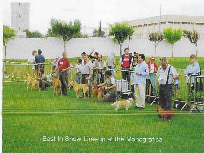
Best in Show Line-up at the Monografica

The best Pequeno Wire puppy was Betty Judges Plushcourt Marisposa. 149 Podengo's were entered in all 3 sizes.