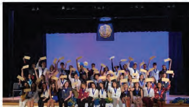
These recent Miami Senior High graduates were awarded scholarships donated by alumni of the historic school, the oldest public school in Miami-Dade County. MIAMI SENIOR HIGH