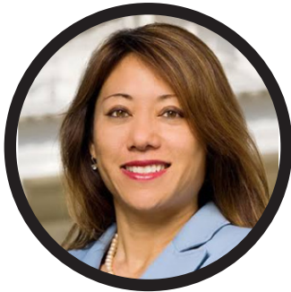
Fiona Ma CA State Treasurer