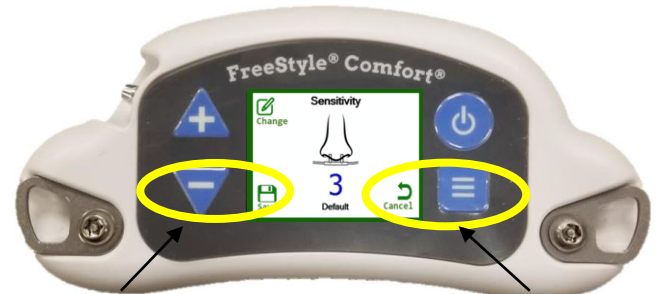
▪ Save Symbol