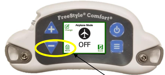
▪ Menu Scroll Symbol