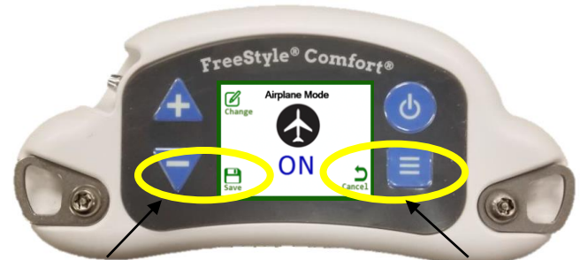
▪ Save Symbol