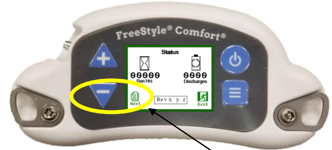
▪ Menu Scroll Symbol