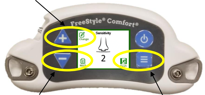
▪ Menu Scroll Symbol