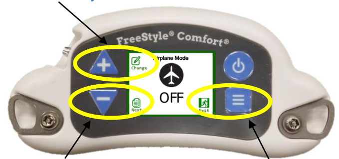
▪ Menu Scroll Symbol