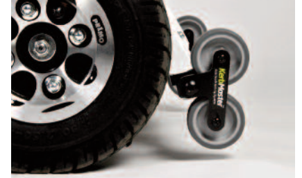
Quintell™ Kerbmaster™ Anti-tipping / Powered Anti-grounding