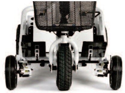
Quintell™ Solenoid Stabilising System Controls Active Tri-Wheel Steering