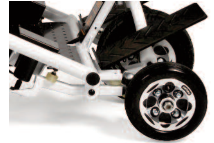
Quintell™ Non-Slip Adaptive Footplates Adjustable to match your measurements