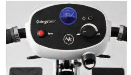
Simple to use ergonomic controls High security ignition & light-up battery gauge