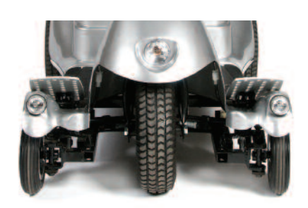
Quintell<sup>®</sup>Self Centering Steering Defaults to straight travel with minimal effort