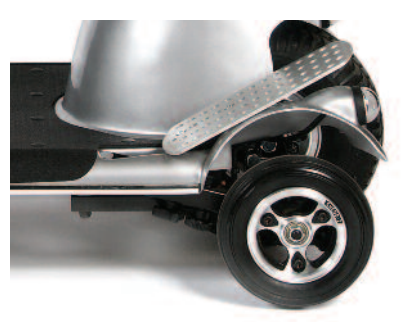
Quintell<sup>®</sup>Adaptive Footplates Adjustable to match your measurements