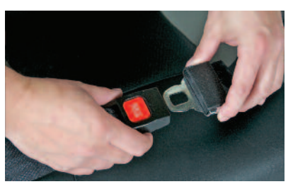
Quick release seat belt Adjustable to match your measurements