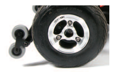
Quintell<sup>™</sup>Kerbmaster<sup>™</sup> Anti-tipping / Powered Anti-grounding