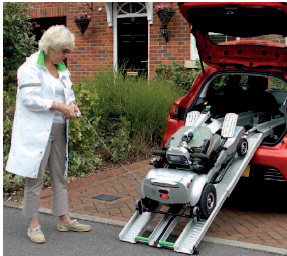
Quingo Flyte Docking Station Easily load and unload the Quingo Flyte in less than 60 secs.