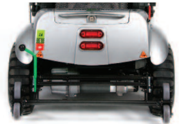
Kerbmaster Anti-grounding & Anti-tipping Smoother and safer journeys with style