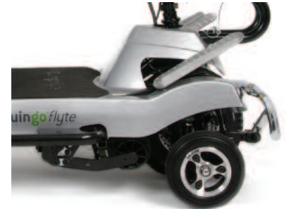
Quintell™ Adaptive Footplates Adjustable to offer best posture