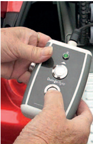
Quingo Flyte Remote Simple two button operation