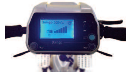
Multi-feature digital dash/LCD display with easy read user controls

For Access Ramps see our 'RAMPS' brochure and price list